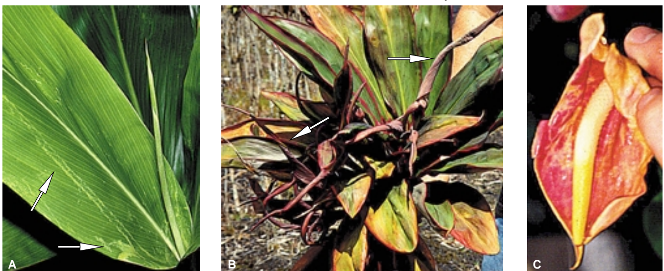
Figure 1. Feeding damage by banana rust thrips on ti and anthurium: A. Streaks and curlicue markings on opened ti leaf. B. Deformed leaf whorls on red ti that failed to unfurl. C. Deformed anthurium spathe.

There are no reports of resistant or susceptible anthurium cultivars, although injury is more noticeable on