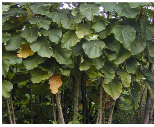
Bingabing is a small tree, 15-30 ft. tall, with columnar stems and rounded leaves with a petiole attached to the middle of the leaf.

Management: Macranga mappa publication (http://www.starrenvironmental.com/publications/ species_reports/pdf/macaranga_mappa.pdf)