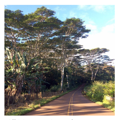
Albizia grows into a large tree, up to 150 ft. tall, with a canopy spread extending over an acre.