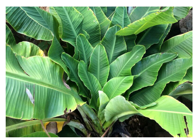
BBTV causes mature plants to have "bunched" leaves that are narrow and wavy with yellow leaf margins.

Description & Management: Banana Bunch Top Virus publication PD-12 (https://www.ctahr.ha-waii.edu/oc/freepubs/pdf/PD-12.pdf).