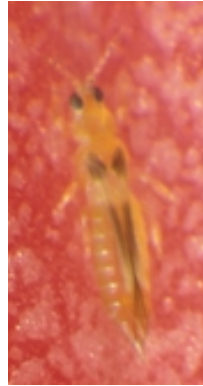
Figure 2. Adult anthurium thrips.

medium, and plant debris near the base of the host plant, but no granular insecticide is currently registered for use in anthurium.