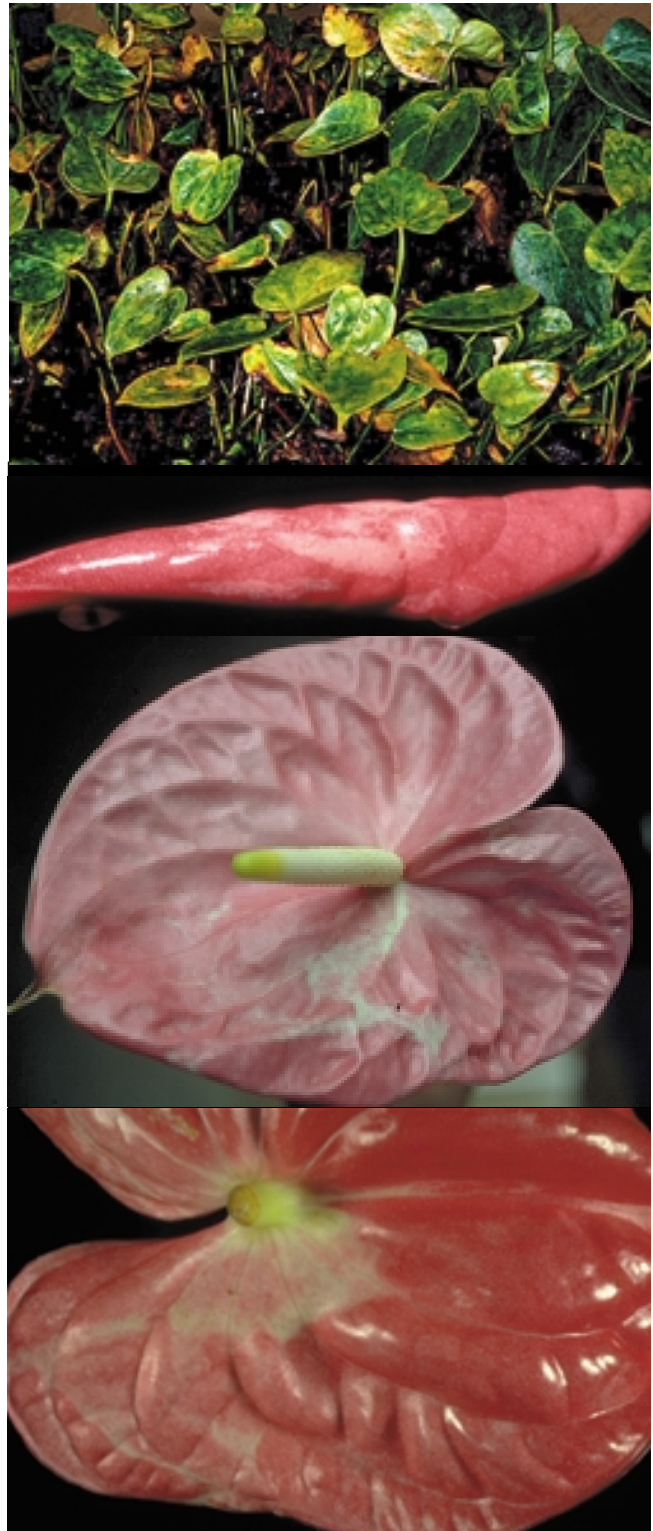
Figure 1. Damage to anthurium by anthurium thrips (top to bottom): leaves; unfurled spathe; front of spathe, ‘Marian Seefurth’ cultivar; back of spathe.

A hot-water dip before planting at 120°F (49°C) for 10 minutes can disinfest anthurium propagative material of thrips. Anthurium cultivars that tolerate hot water treatment as rooted plants with leaves include ‘White Lady’, ‘Blushing Bride’, and ‘Kozohara’, while ‘Ozaki’ can-