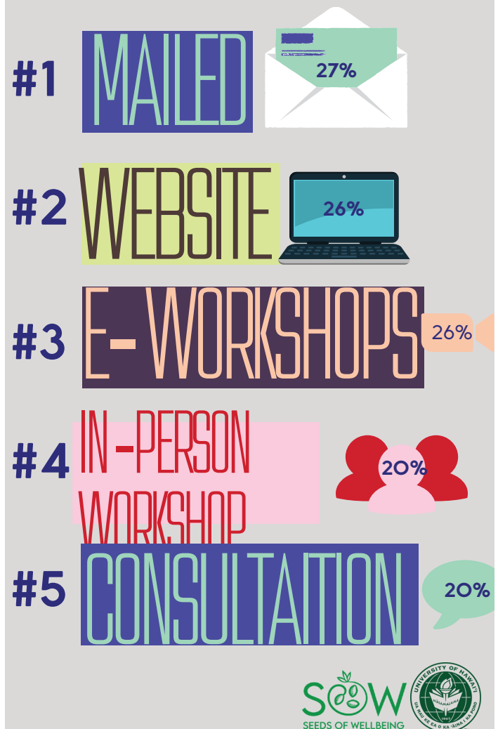
Figure 3. Hawai'i's Ag Producers Request for Support & Format of Support