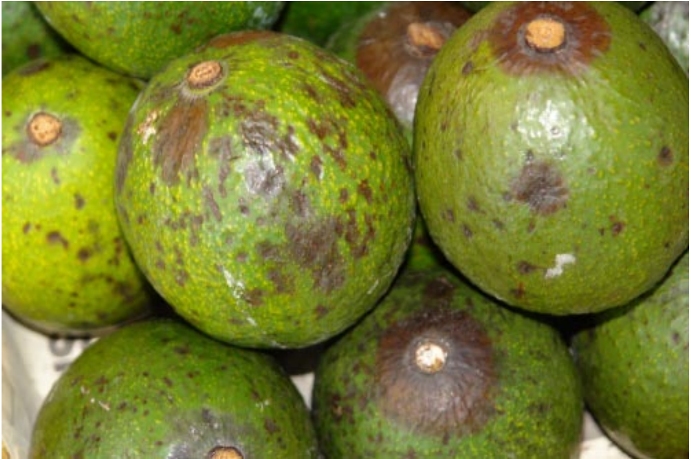
Anthracnose lesions on ripening avocado fruits in a farmer's roadside fruit stand near Kailua-Kona on Hawai'i. Plant-pathogenic fungi other than C. gloeosporioides can cause the stem-end rot symptoms shown here.

West Indian types) or thick, warty, and hard (Guatemalan types). The edible fruit flesh varies in fibrousness, color (greenish to yellowish), oil content, and flavor (mild and watery to rich and nutty). The avocado center of origin is Meso-America. Archaeological evidence indicates that humans have cultivated the avocado for at least 10,000 years. However, commercial development of avocado as a crop did not begin until the 20th century, following introduction of avocado plants to California.