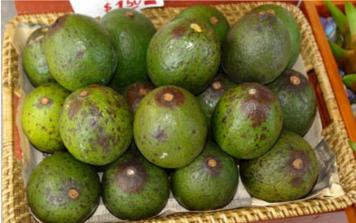
Spots and stem-end rots typical of anthracnose in a farmer's market near Kailua-Kona

pounds present in unripe skin usually inhibit pathogen growth. During and after fruit ripening, the pathogen grows rapidly through the peel and into the pulp of fruits.