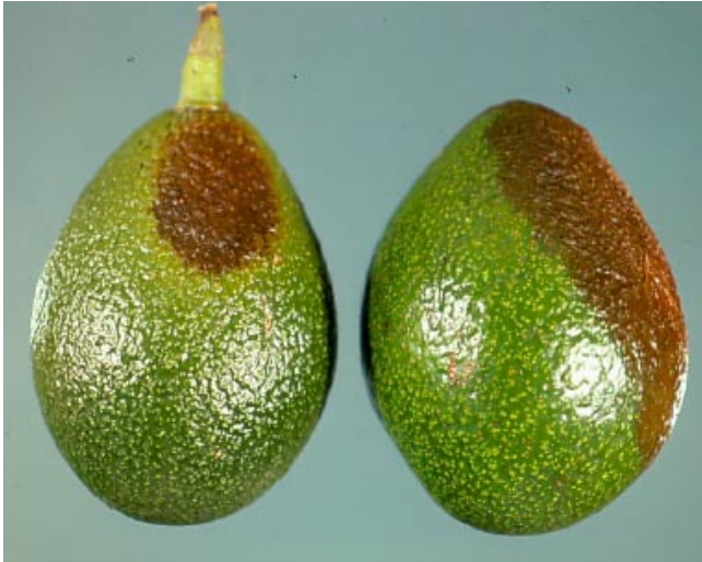
Anthracnose lesions on avocado