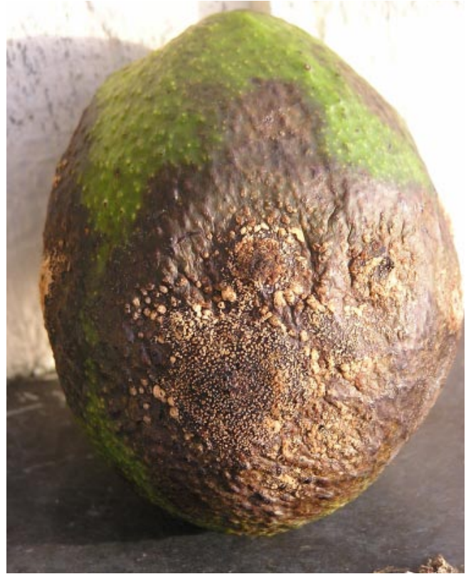
Large avocado anthracnose lesions; the fruit at right has masses of salmon-colored spores typical of the pathogen, C. gloeosporioides

The site of infection is primarily the fruits, but infections may also appear on leaves and stems. Unlike the form of anthracnose that infects mango, C. gloeosporioides does not attack avocado flowers.