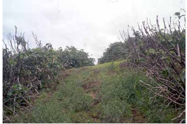
Massive defoliation of 'awa plants in a monoculture on the Hāmākua Coast of the island of Hawai'i