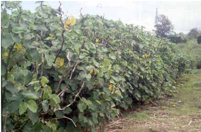
Stem symptoms and defoliation due to shot hole disease of Piper methysticum in Hawai'i. Damage can be severe during wet periods, resulting in reduced yields and even plant decline or death.