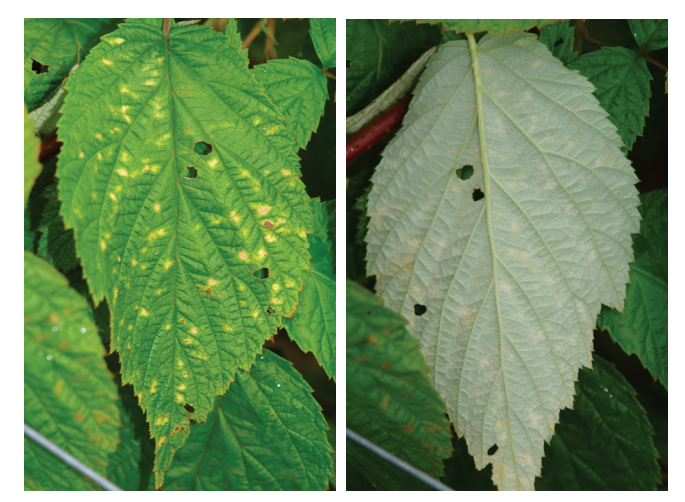
Left: Early symptoms of late rust on the upper surface of a mature leaf of highly susceptible 'Caroline' include chlorotic yellow spots scattered over the leaf surface. Right: On the lower leaf surface, uredinia form, containing powdery, light yellow masses of urediniospores.