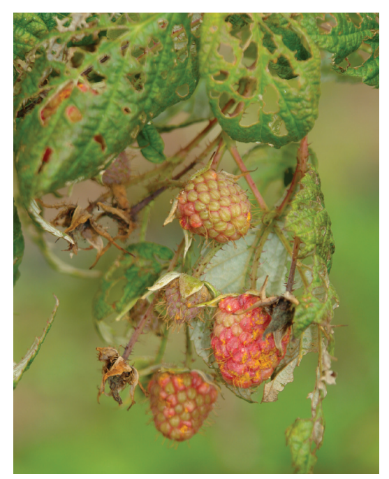
Raspberry late leaf rust causes precocious (uneven) ripening of infected drupelets and renders fresh fruits unmarketable.

Farmers usually grow red raspberries in plant hardiness