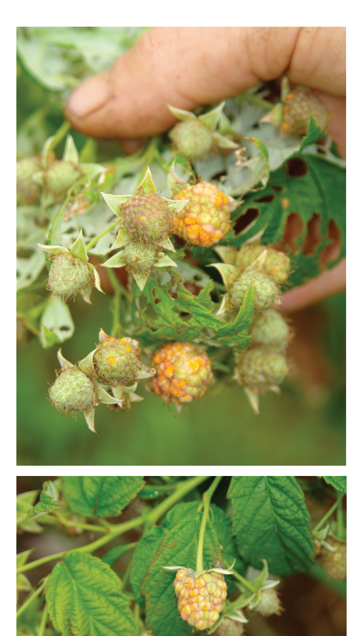
"Rusted" green fruits of the cultivar 'Caroline,' showing masses of urediniospores on individual drupelets.

Fungicides. Although some fungicides may be available for control of late rust of raspberries in Hawai'i, such products would generally not control the disease economically on tropical farms. We advise use of the non-chemical, integrated practices described above.