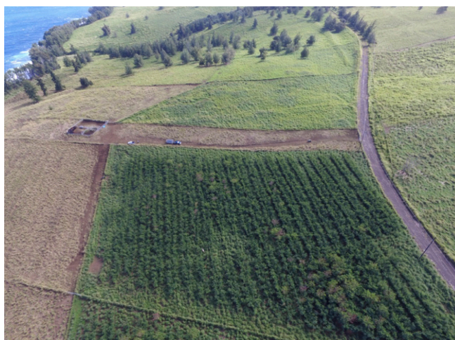
Figure 2. Photograph of the LP pastures (foreground) and CP. The cattle-handling facility alley separates the treatment pastures.

Table 2 summarizes the carcass characteristics and shear force measurement. For the LP group, hot carcass weight was heavier (740.4 vs. 708.6 lb), marbling score (421.2 vs. 381.1) and backfat thickness (0.23 vs. 0.15 lb) were higher, rib eye area was larger (13.6 vs. 12.6 in 2 ), and age at slaughter was lower (2.1 vs. 3.0 yr) as compared to the CP group. The USDA-equivalent quality grade was higher for LP carcasses, averaging low Choice