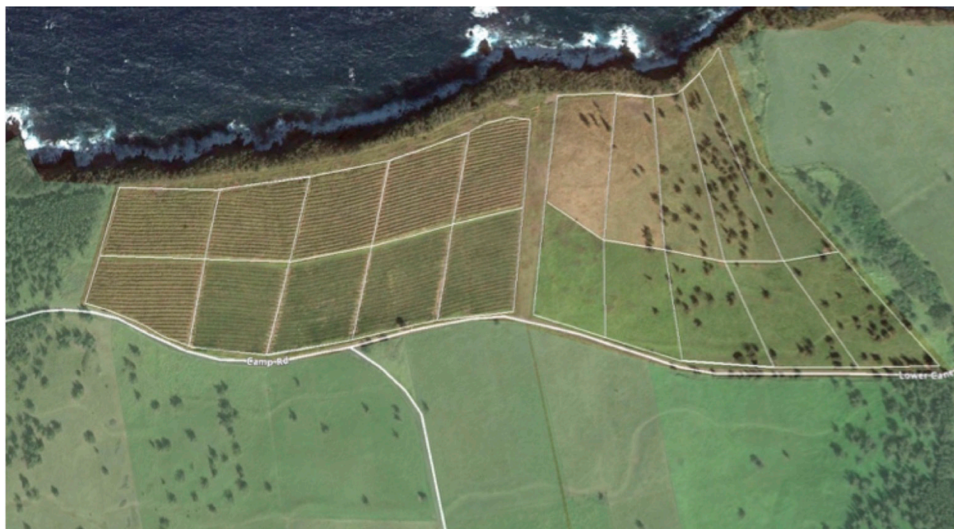
Figure 1. Google Earth image of treatment pastures, LP (on left) and CP. Treatment pastures are equal in size (48.5 acres), paddock number, rotation days (70 days), stocking rate, and management.

Forage samples were collected prior to cattle rotation into a new paddock to measure the forage value at 70 days of re-growth. Forage samples were dried in a force