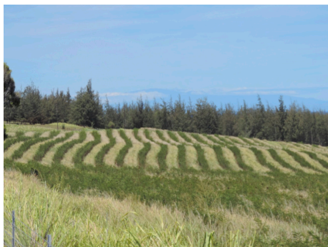
Figure 3. Photograph shows a well-established pasture of alternating rows of Leucaena and guinea grass at the start of the study.