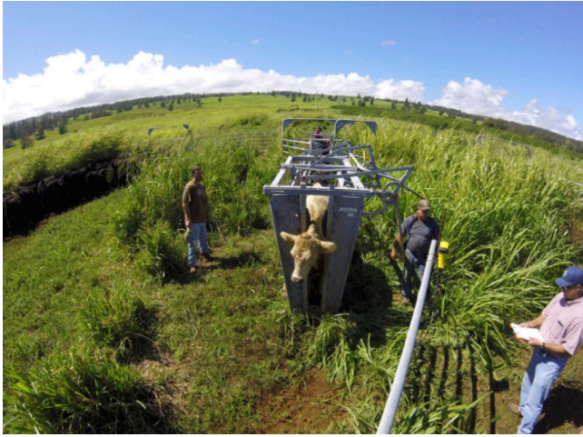
Figure 4. Cattle were weighed after a full rotation through the 10 paddocks over a 70-day period.