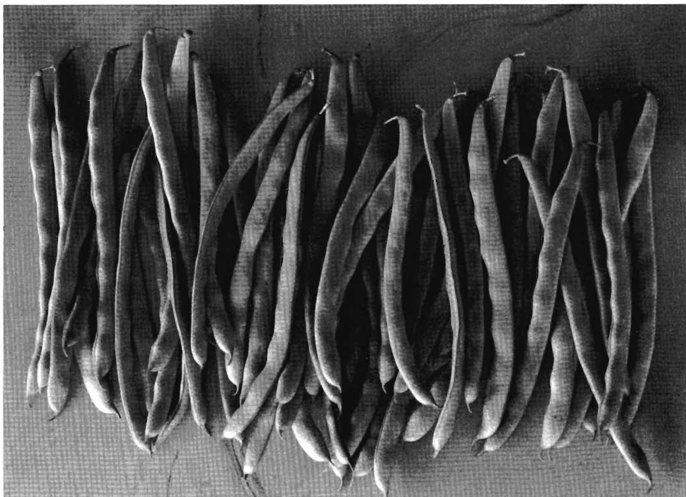
Figure 2. Harvested beans of 'Poamoho' showing indication of seed development.

'Poamoho' has been tested at experimental farms throughout the state (Table 2). The results from different farms varied widely. Some of the differences may be due to different row widths, since different farms used different spacings. Three replications were grown at each farm. No results are shown from Waimanalo Farm because all 'Poamoho' plots there were damaged by birds. The one consistent finding is that 'Poamoho' always outyielded both 'Hawaiian Wonder' and 'Manoa Wonder'. In all cases except at Pulehu (Maui), the differences were statistically significant. (Other breeding lines similar to the one that is being named 'Poamoho' were also tested; all the breeding lines nearly always outyielded 'Hawaiian Wonder' and 'Manoa Wonder'.) 'Poamoho' usually was about 3-6 days earlier, as well.