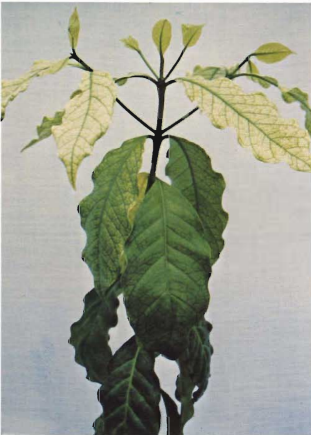
Figure 18. Iron deficiency, severe. Young leaves are yellow-green to creamy white.