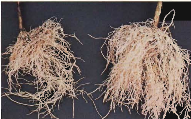
Figure 6. Phosphorus deficiency, effect on root development. Deficient plant (left); control plant (right).