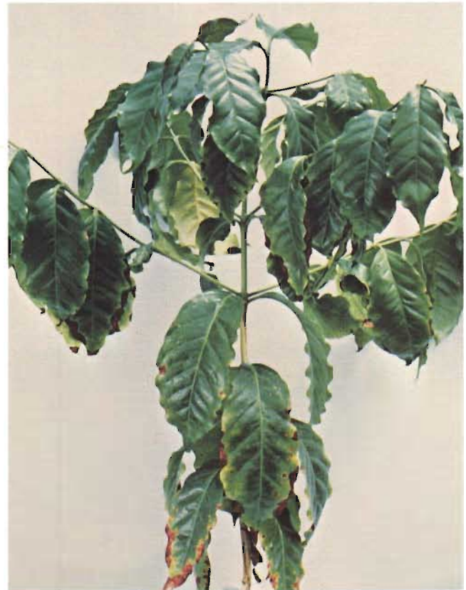
Figure 8. Potassium deficiency, advanced symptoms. Marginal necrosis of older leaves while young leaves remain unaffected.