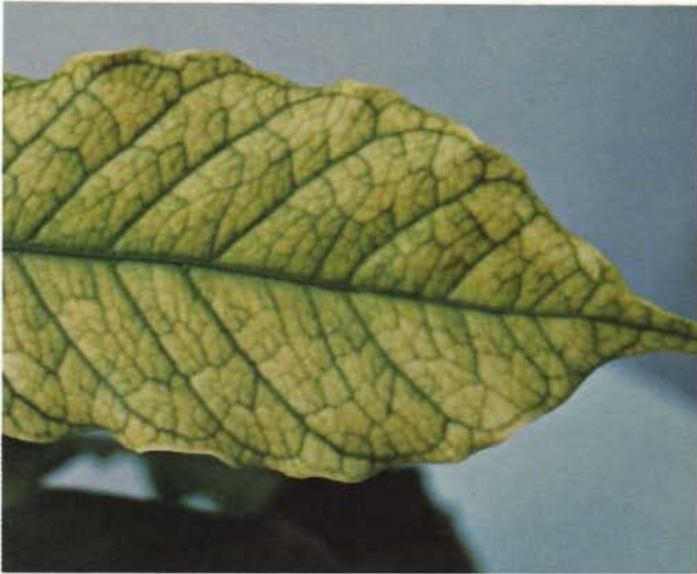
Figure 17. Iron deficiency, advanced symptom. Distinct interveinal chlorosis in young leaf.