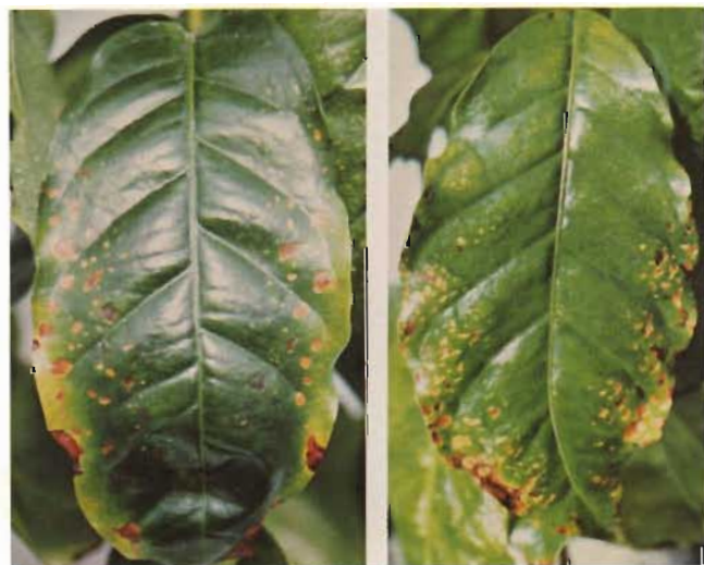
Figure 12. Magnesium deficiency, early symptoms. Chlorosis along margins of older leaves and development of a wide band of necrotic spots along leaf margins (left). Necrotic spots along margins are more numerous with continued deficiency (right).