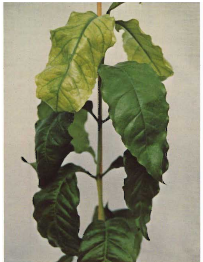
Figure 16. Iron deficiency, early symptom. Interveinal chlorosis of younger leaves.