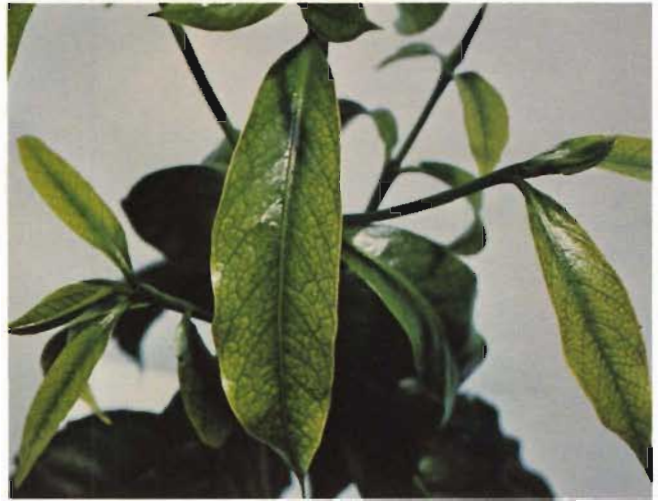
Figure 23. Zinc deficiency, advanced symptoms. Young leaves interveinally chlorotic and straplike.