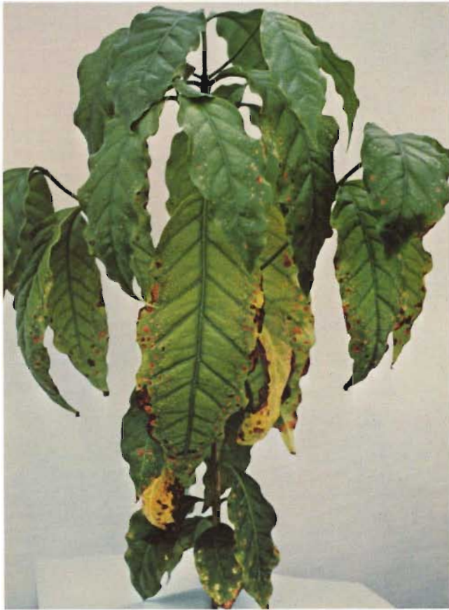
Figure 13. Magnesium deficiency, advanced symptom. Interveinal chlorosis of older leaves.