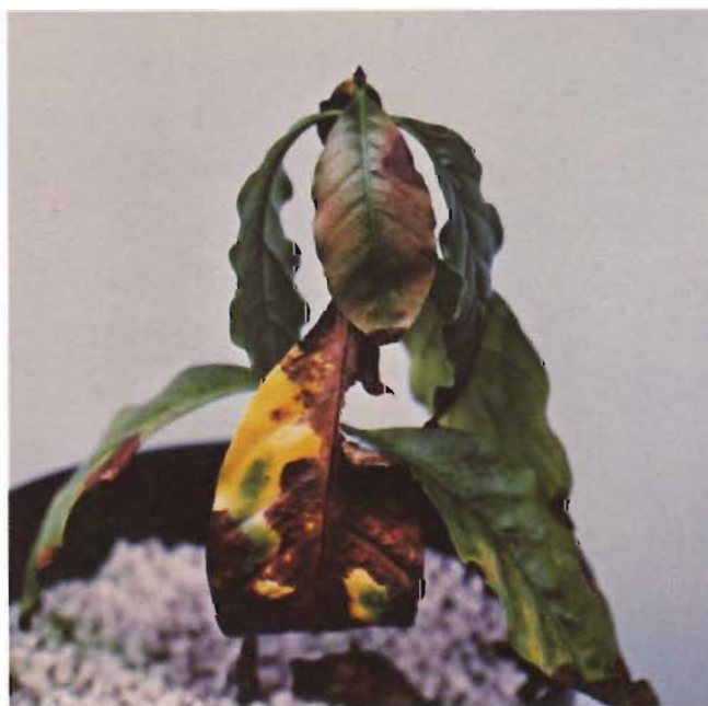
Figure 10. Calcium deficiency, advanced symptoms. Young leaves are necrotic, and the shoot apex dies back.