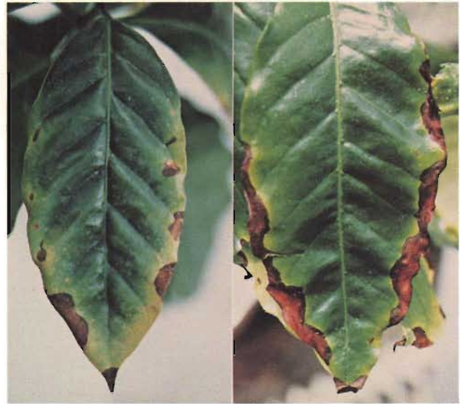
Figure 7. Potassium deficiency, early and advanced symptoms. Older leaf with initial symptoms of chlorosis and necrotic spots along margins (left); in advanced deficiency, leaf margin is necrotic with a chlorotic halo (right).