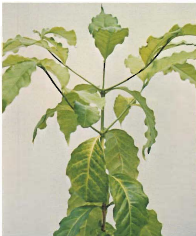
Figure 3. Nitrogen deficiency, advanced symptoms. Entire plant pale green, with whitish veins evident after prolonged deficiency.