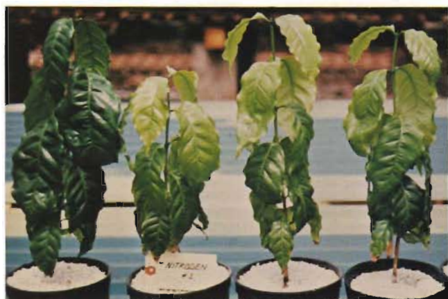
Figure 1. Nitrogen deficiency, early symptom. General chlorosis of young leaves. Control plant (left); three deficient plants (right).