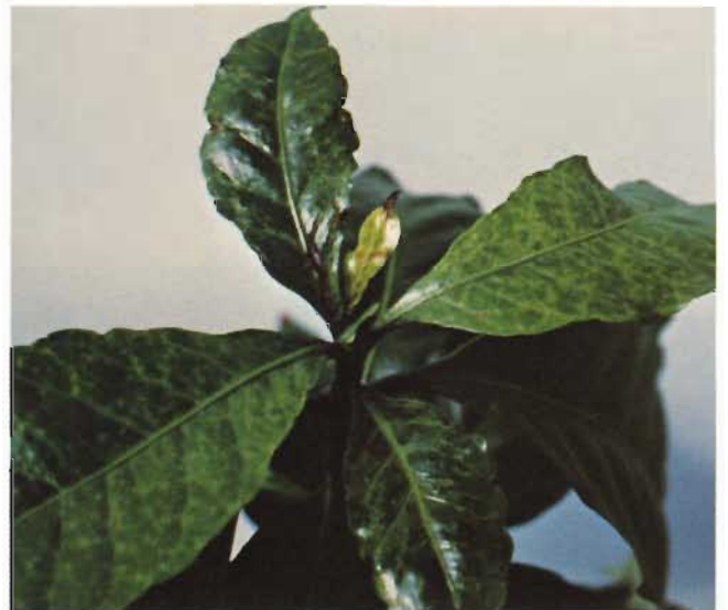
Figure 20. Boron deficiency, effect on leaf development. Young leaves mottled with necrotic spots.