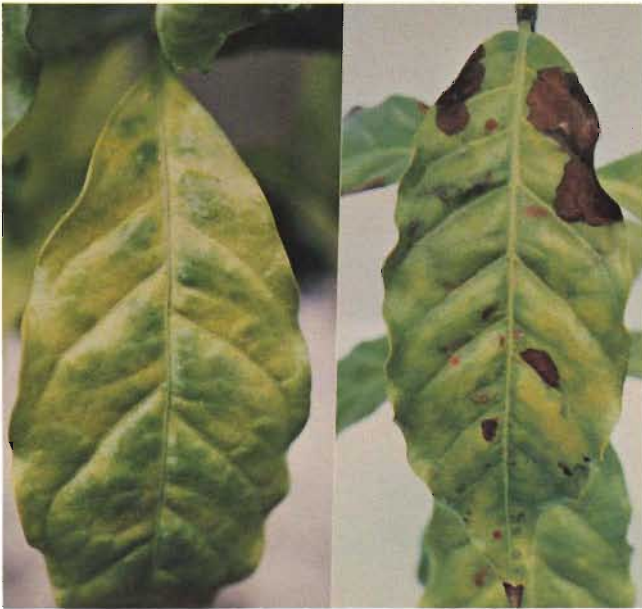
Figure 5. Phosphorus deficiency, advanced symptoms. Faint interveinal yellowing of older leaves (left). Necrotic spots may develop in older leaves during acute deficiency (right).