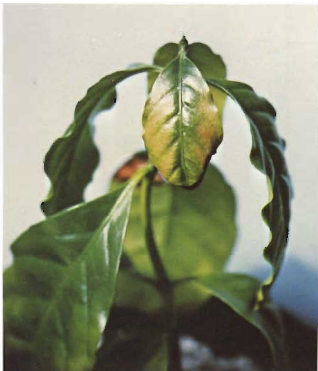
Figure 9. Calcium deficiency, early symptom. Bronze coloration of young leaves.