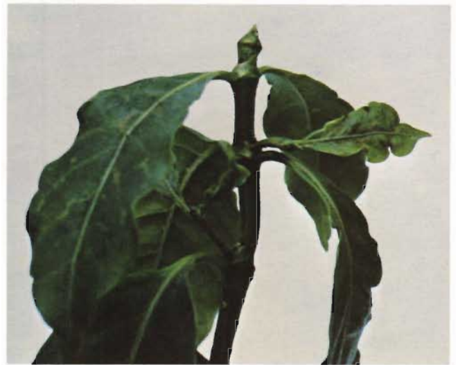
Figure 19. Boron deficiency, effect on shoot growth. Abnormal growth of shoot apex and young leaves.