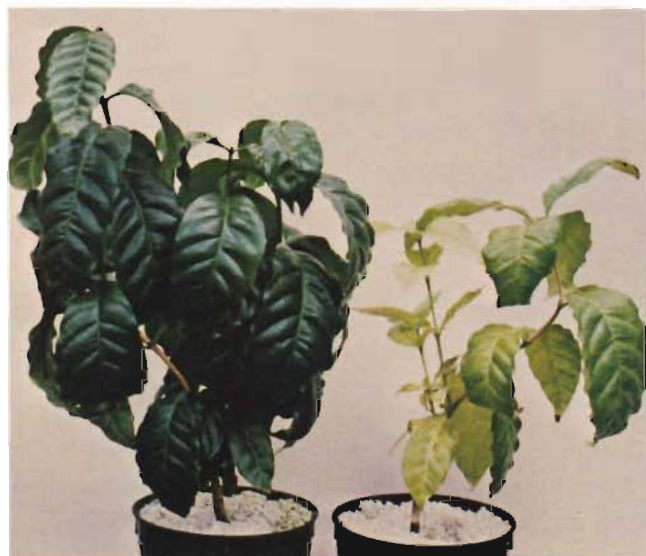
Figure 2. Nitrogen deficiency, effect on shoot growth. General chlorosis of entire plant and reduction of vegetative growth after continued N deficiency (right).