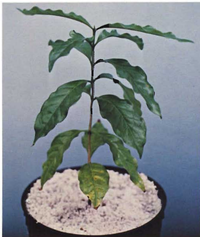
Figure 4. Phosphorus deficiency, early symptom. Mottled chlorosis of the oldest leaves.