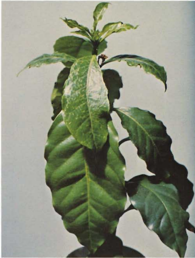
Figure 21. Boron deficiency, advanced symptoms. Irregular margins of young leaves and abnormal growth of apical buds.