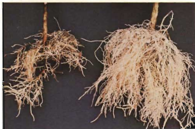
Figure 11. Calcium deficiency, effect on root development. Deficient plant (left); control plant (right).