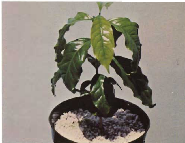
Figure 14. Sulfur deficiency, early symptom. Chlorosis of young leaves, particularly along the midvein.