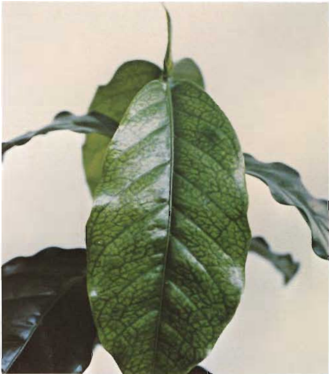
Figure 22. Zinc deficiency, early symptom. Inter-veinal chlorosis of young leaves.