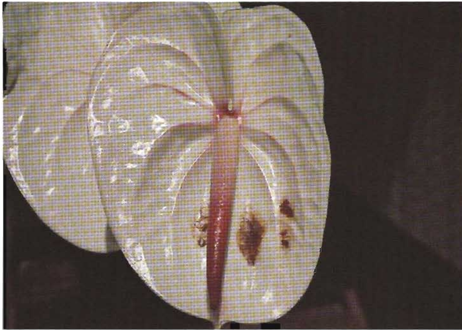
Figure 6. Kclthane injury on Kobayashi cultivar. Damage is confined to the spathe, which develops distinct necrotic areas.