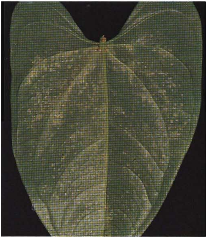
Figure 7. Tempo 2 EC was safe on the majority of anthurium cultivars tested; however, white spots appeared on the undersides of leaves on Mickey Mouse cultivar.

that would not occur if each pesticide were applied separately. Before pesticides are tank mixed, a compatibility chart should be consulted. Wettable powders should be mixed with other wettable powders and emulsifiable concentrates with other emulsifiable concentrates. Plant injury also may occur when equipment previously used for herbicides is used to apply insecticides.