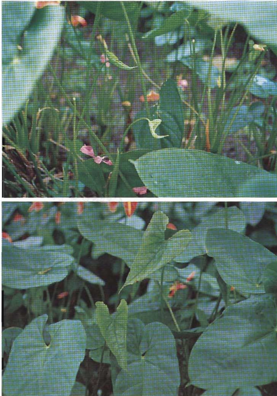
Figure 2. Vydete injury on Nitta cultivar. The first indication of phytotoxicity appears with the new emerging leaves (top). Leaves appear mottled and deformed at maturity (bottom).