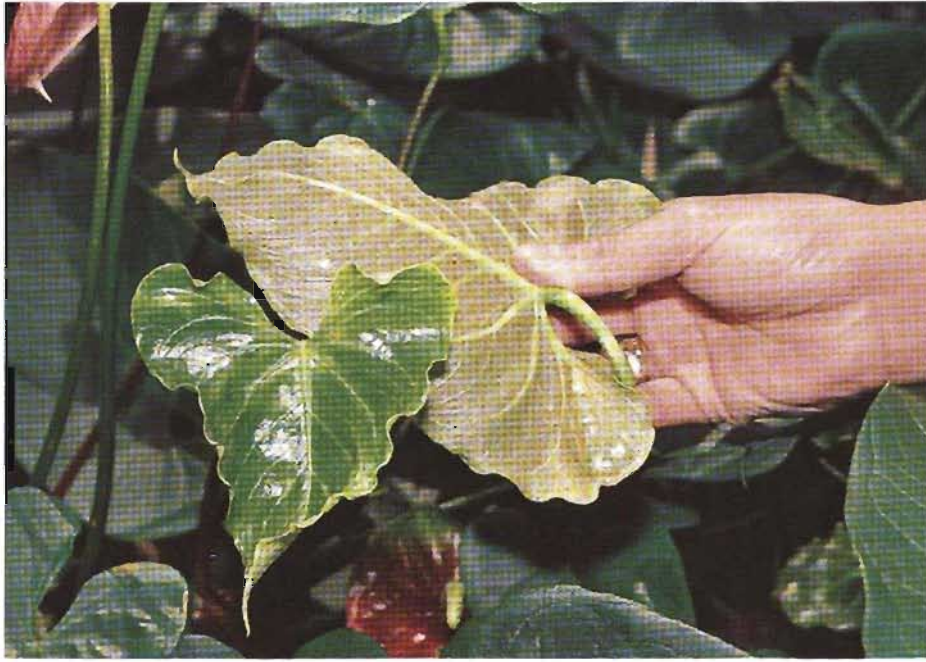
Figure 5. Isotox injury on Anuenue cultivar. Abaxial surfaces appear bronze.