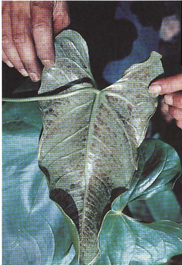
Figure 3. Orthene injury. Bronzed abaxial surfaces are a characteristic injury symptom.