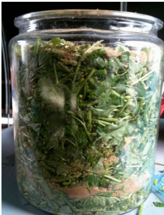
Fig. 4. Pack the plant material and brown sugar in a container until full.

For long-term storage, add an equal amount of brown sugar by weight to FPJ to prevent it from souring.