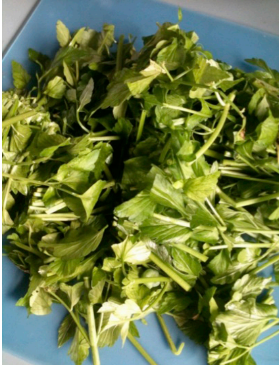
Fig. 2. Cut plant material into 2- to 3-inch lengths.

In order for the fermentation process to occur properly, the volume of the plant-material-and-brown-sugar mixture should settle to \frac{2}{3} of the container after 24 hours. If the container is too full, the microbes will not have enough air to properly ferment. Remove some of the plant material until the container is no more than \frac{2}{3} full. If the container is less than \frac{2}{3} full, add more of the mixture to prevent mold growth. Not all plants will settle in the same way, so it is important to check and adjust the volume after the first 24 hours.