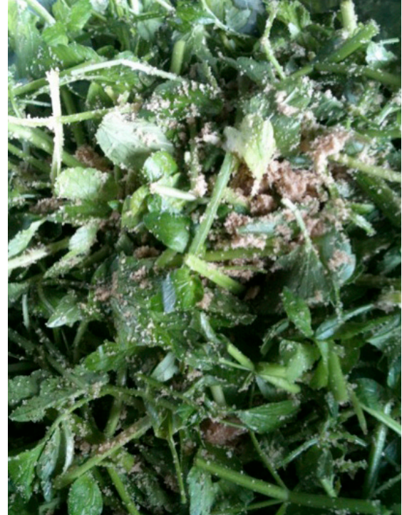
Fig. 3. Add equal weight of brown sugar to cut plant material.