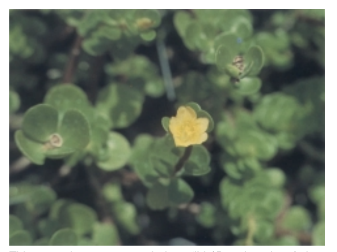
This groundcover or potted plant, 'ihi ( Portulaca lutea ), has succulent leaves and single-petaled, bright yellow flowers.

Description. Portulacas are small, usually succulent herbs. There are seven native Hawaiian species. There is also a weedy portulacca found in Hawai'i, the purslane ( P. oleracea ), and a cultivated one, the moss rose ( P. grandiflora ).