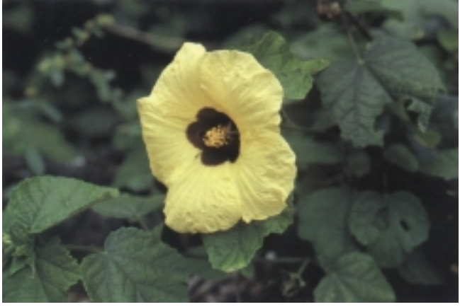
The large, bold, yellow flowers that bloom regularly are a striking feature of Rock's Kaua'i hibis cus ( Hibiscus calyphyllus). It is useful as a groundcover or shrub.