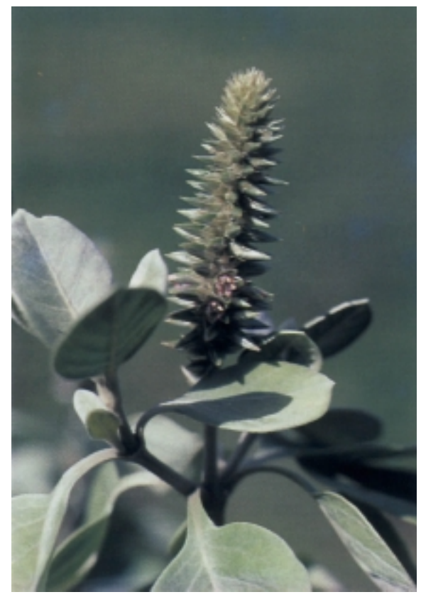
Leaves and flower spike of the very drought tolerant shrub, 'ewa hinahina ( Achyranthes splendens var. rotundata ).