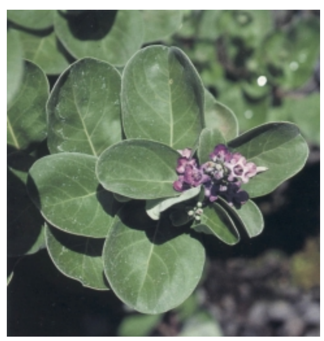
Beach vitex (Vitex rotundifolia ) is a creeping groundcover with silvery, oval leaves and clusters of lavender flowers.

Description. Pohinahina is a groundcover or sprawling shrub, 6 inches to 2 feet tall. It spreads laterally and grows rapidly once established. It has silvery, oval leaves that sometimes have a tinge of lavender near the margins.