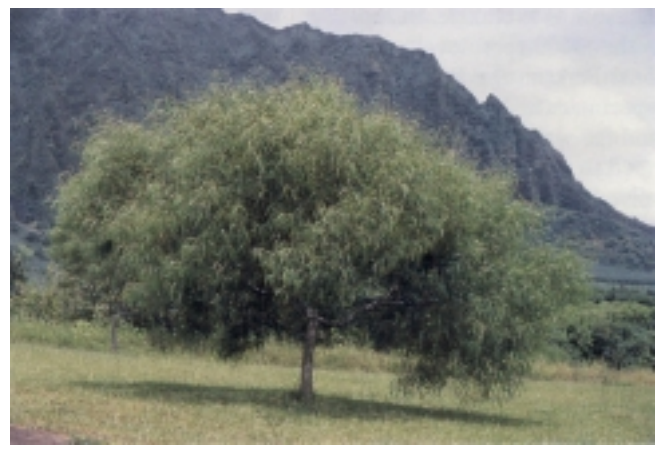
Koai'a ( Acacia koaia ) is a medium-sized, less-thirsty tree, growing here at Ho'omaluhia Botanic Garden.