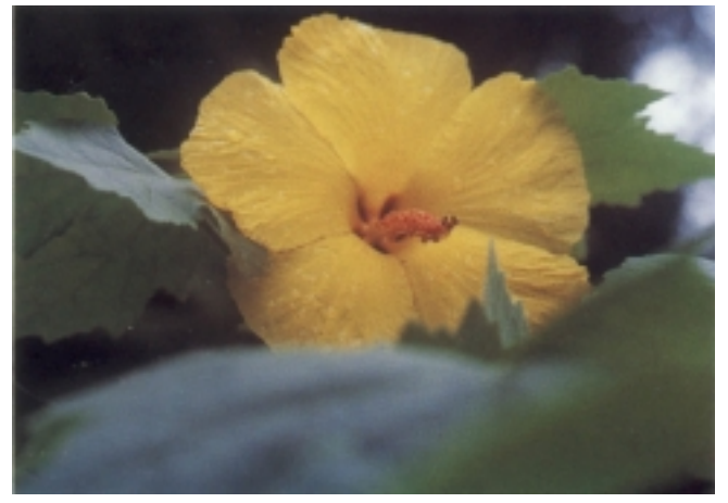
Ma'o hau hele ( Hibiscus brackenridgei ) is Hawai'i's official state flower. It usually blooms in the spring.

Pests. Chewing and sucking insects sometimes attack