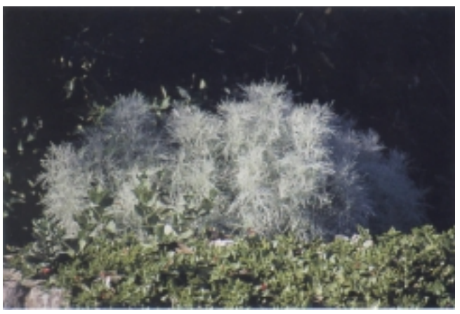
The silvery grey leaves of this shrub or potted plant, 'ahinahina (Artemesia australis), are finely divided. It provides an accent in a dryland garden.

Landscape uses. In the wild, 'āhinahina grows around boulders or on steep cliff faces. Similar uses can be made of them in the landscape. Plant them around boulders, on well drained slopes, or in large clay or cement pots. They prefer full sun.