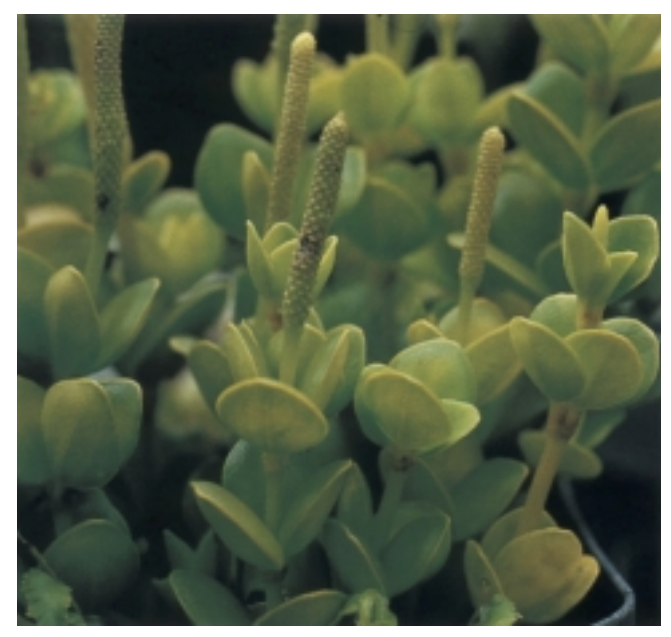
Leaves and flower spikes of 'ala'ala wai nui ( Peperomia spp.), a less-thirsty, shade tolerant groundcover or potted plant.

Propagation. Peperomias grow well and easily from cuttings. Either stem or tip cuttings work fine. Make cuttings 3–4 inches long, remove the lower leaves, cut the upper leaves in half, and cut off any flower spikes. Flower growth and seed development takes energy away from the plant. You want to channel this energy into root production. You can plant the seed spikes separately and grow the seedlings too. The cuttings do not seem to need