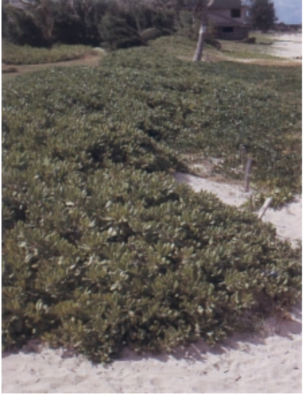
The beach naupaka ( Scaevola sericea ) is an extremely tough and easy-to-grow shrub, ground-shrub, or groundcover that is salt, wind, and drought tolerant.

Propagation. Naupaka kahakai is very easy to grow from seed. Some reports state that the seeds germinate better