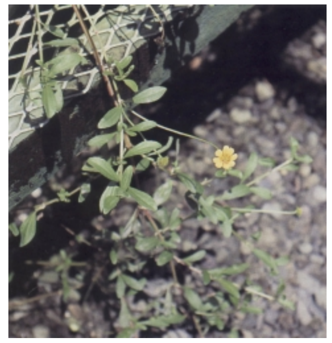
Nehe ( Lipochaeta integrifolia ) is an easy-to-grow sprawling plant with yellow, daisy-like flowers.