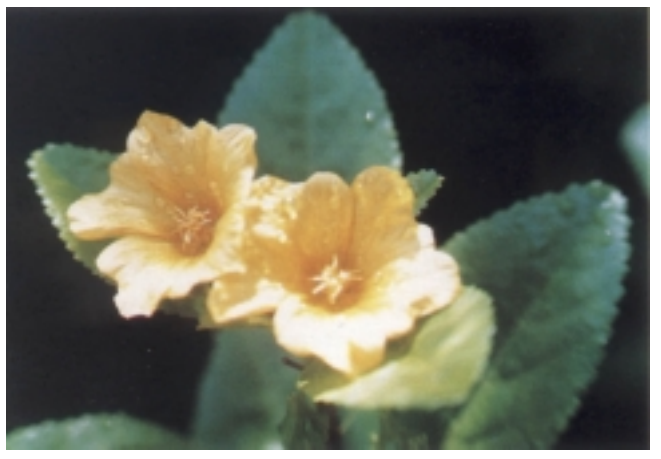
'llima ( Sida fallax ) has small, bright yellow flowers. It is a hibiscus relative. The flowers are made into the lei of O'ahu.

Propagation. 'Ilima papa is easily grown from seeds or cuttings.