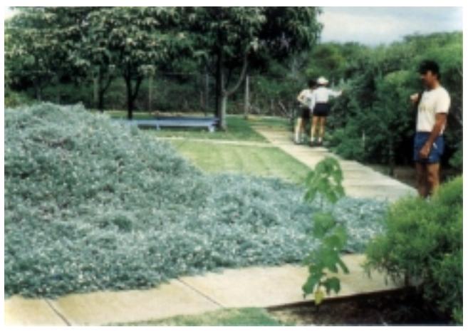
Hinahina ( Heliotropium anomalum ) growing on a mound of sand at the Maui Zoo and Botanical Garden.

Pests. Some sucking insects like mealybugs sometimes attack nehe. Standard insecticides may be used. A wettable powder formulation is best.