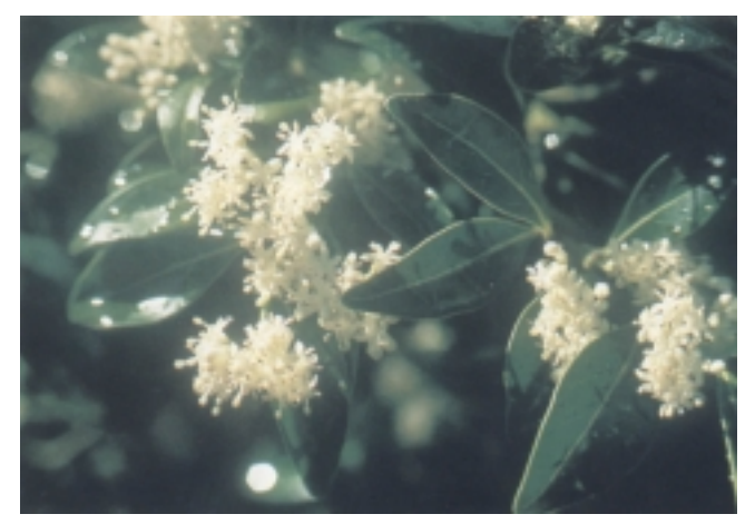
Clusters of fragrant, white flowers enhance the deep green, glossy leaves and white bark of alahe'e.

Other uses. The wood is very hard and dense. In the past, when the tree was more abundant, it was favored for making long-lasting fence posts in pastures. The Hawaiians probably used it for tools and weapons.