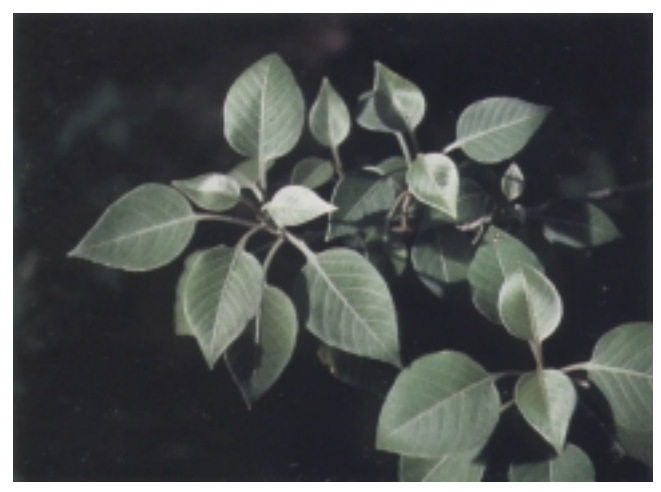
Kulu'i ( Nototrichium sandwicense ) is a silvery-leaved, tough, drought and salt tolerant shrub, ideal for the less thirsty land-scape.

Propagation. Kulu'i is easy to grow from cuttings. Collect the cuttings and propagate right away. Trim back three-forths of the leaves, either cutting them off or in half. Stick several cuttings in a pot of perlite or a 1:1 mixture of perlite and vermiculite. They also will root