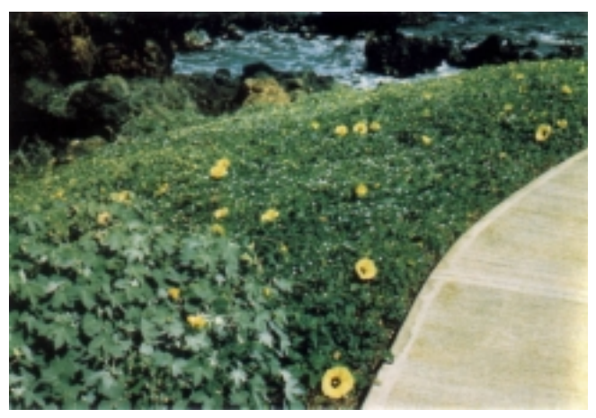
Hibiscus calyphullus in an attractive hotel landscape on Maui. Ma'o (Gossypium tomentosum) is in the foreground and p\bar{a}'\bar{u} o Hi'iaka (Jacquemontia ovalifolia) is mixed in with the hibiscus. The plants are kept low with a string trimmer. Large, handsome, yellow flowers appear each morning to brighten the landscape.

Propagation. It is easy to propagate from cuttings or seeds. To grow it from cuttings, take a two- to three-node cutting (about 3 to 4 inches long), stick about a third of the cutting in a pot of potting medium, and water it daily. Most well-drained media will work for propagation. Rooting hormone is not needed for cuttings. To grow p\bar{a} ' \bar{u} o Hi'iaka from seeds, plant them (there are several tiny seeds to each brown, papery seed capsule) on firm, pre-moistened potting medium. Lightly cover