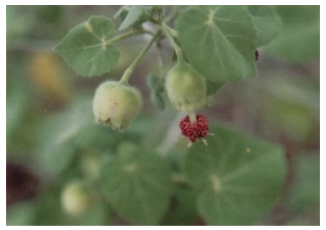
The green petals of this rare hibiscus relative, hidden petaled 'ilima ( Abutilon erimetopetalum ), are hidden behind the calyx.

Notes of interest. This plant was thought to be extinct. It had not been seen since the 1920s. Bill Garnett of Waimea Arboretum and a state forester looked for this and other rare plants on Lana'i. They found a few plants "eaten to the 6-foot level by alien Axis deer."