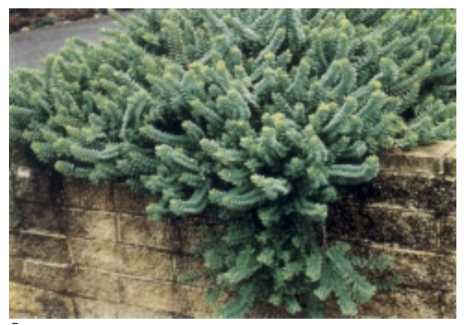
Ākia ( Wikstroemia uva-ursi ) is a groundcover plant with imbricately arranged leaves and four-part, yellow flowers that are followed by a red fruit. Here, it sprawls over a tile wall.

Description. 'Ākia is a small, sprawling groundcover with oval, waxy, green leaves that are arranged in an imbricate pattern. Its flowers are small, four-part, yel-