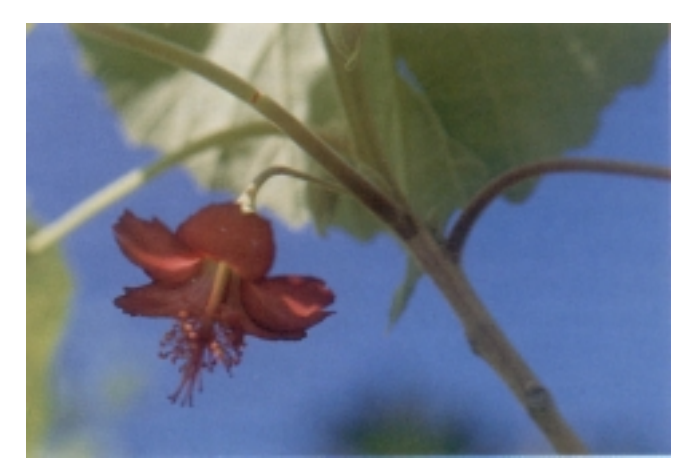
Koʻoloa ʻula ( Abutilon menziesii ). Close-up of the flower of this less thirsty shrub.

Description. 'A'ali'i is a shrub or, with time, a small tree. It grows 3–10 feet tall. The leaves are glossy green with reddish midribs and stems. The flowers are either male or female and are fairly small and insignificant (about <sup>1</sup>/<sub>4</sub> inch in diameter). The female flowers develop