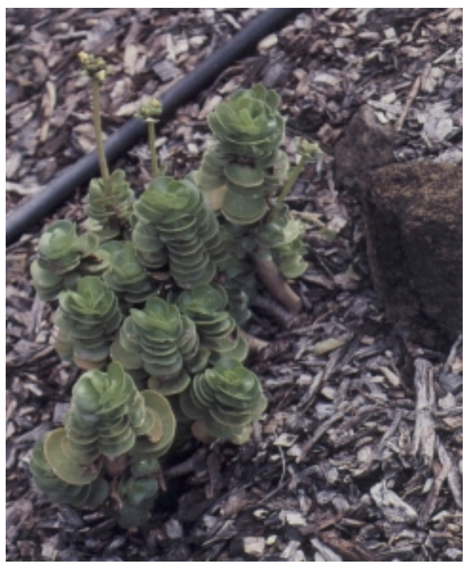
Portulaca molokiniensis forms a rosette of succulent leaves arranged in an imbricate pattern, which gives this specimen plant a highly ornamental appearance.

Portulaca molokiniensis is a recently described species and comes from the offshore islets Molokini and Pu'ukoa'e and from Kamōhio Bay, Kaho'olawe. It was described by State of Hawai'i forester Robert Hobdy, who did a survey of the flora of the offshore islands of Maui County. It has very succulent, imbricate leaves that give the plant an attractive and interesting appearance. The round, corky stems with their succulent leaves stand more upright than most other portulacas. The plants can reach a height of about 1 foot. The flowers are lemon yellow and are found in clusters at the tips of the stems. When the plant is going to flower, it sends a leafless, flower-bearing stem above the succulent leaves.