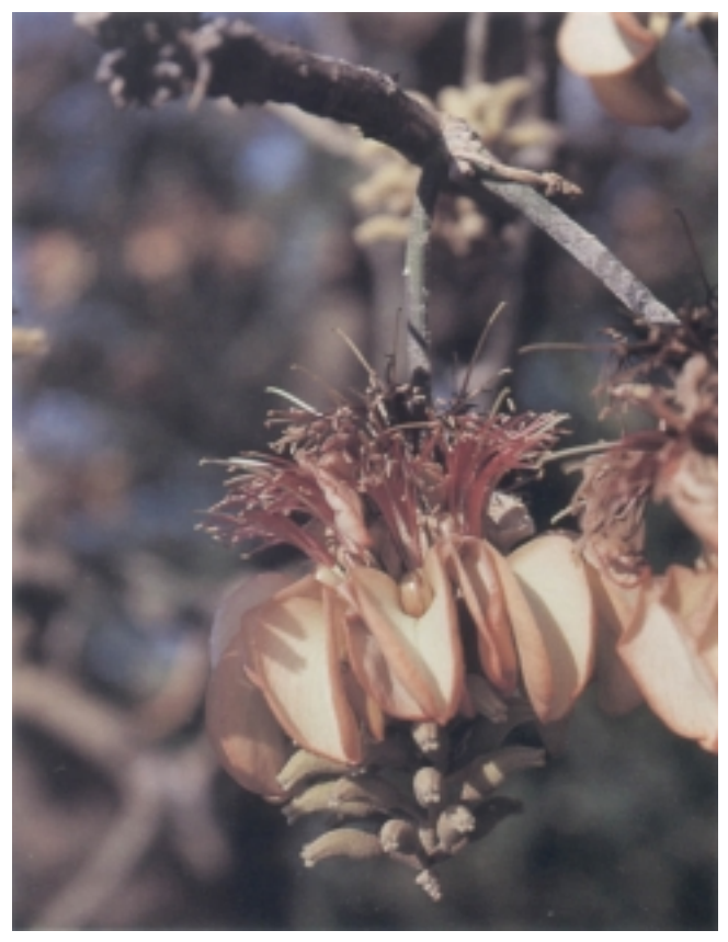
The large, pea-shaped flowers of wiliwili ( Erythrina sandwicensis ) come in a range of pastel colors from chartreuse to apricot.

Propagation. Wiliwili is grown easily and rapidly from seed. Place some of the orange-red seeds in a water-