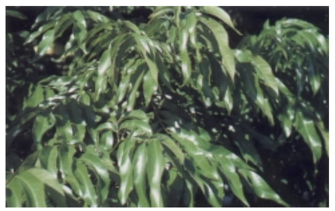
The glossy, pinnate leaves of mānele ( Sapindus saponaria ) are an attractive feature of this medium-sized tree.

Landscape uses. It is attractive when grown in its natural form or pruned into a desired shape. It makes a very