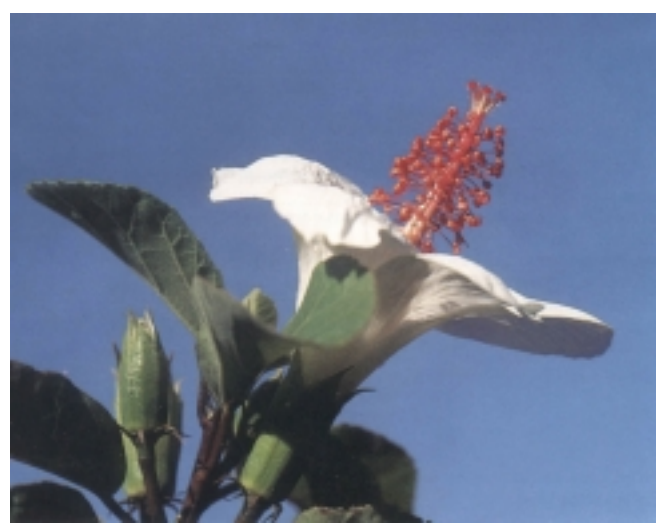
Hibiscus waimeae , koki'o ke'oke'o, a fragrant Hawaiian hibiscus from Kaua'i, is an attractive and unique landscape plant.

it can be kept low with a string or blade trimmer. It is also attractive if allowed to grow more freely as a rambling shrub. It can be trained into a hedge. It will grow well in a large pot. The large, clear-yellow flowers, with their velvety, purple-black throats, make striking splashes of color in the garden.