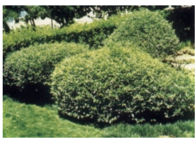
Alahe'e ( Psydrax odoratum ), a less-thirsty shrub or small tree, pruned and shaped into bonsai at the Japanese Garden of the East-West Center at the University of Hawai'i at Mānoa.

Notes of interest. The name alahe'e is an example of the poetic nature of the Hawaiian language. Ala means "fragrant" and he'e means "octopus" or "slippery like an octopus." Alahe'e has blossoms that you can stick your nose into and smell, but they are better enjoyed by letting the breeze waft the scent to you. The Hawaiians expressed all this as a "slippery fragrance." Alahe'e has very hard wood with a straight grain. The wood was used for ' \bar{o} 'o (digging sticks) and spears.