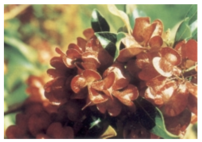
Brilliant red seed capsules of this 'a'ali'i ( Dodonaea viscosa ) can be used in haku lei (worn in the hair) or in fresh or dry flower arrangements.

Other uses. The seed capsules are attractive and are prized for haku lei. Flower arrangers have recently discovered them and use them in dry and fresh arrangements. If hung to dry in a well ventilated area, the fruit clusters will keep for years.