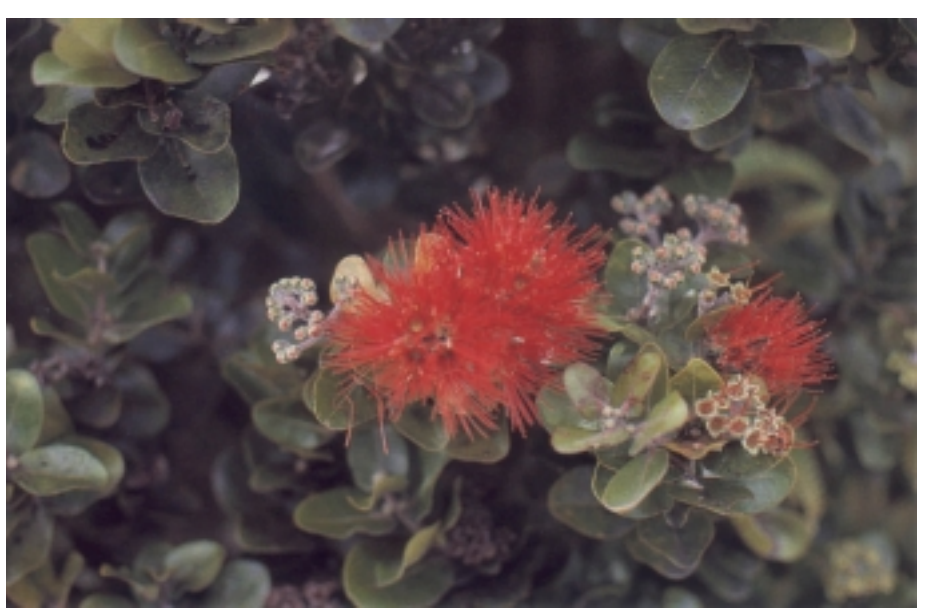
Flowers and leaf buds of 'ōhi'a ( Metrosideros polymorpha ) are highly prized for Hawaiian lei.

To grow ' \bar{o} hi'a from cuttings, a mist system is required. Use of a 10 percent solution of Dip-N-Gro<sup>®</sup> is beneficial. Select wood <sup>1</sup>/<sub>4</sub> inch in diameter and 4–6 inches long. Tip and stem cuttings with healthy leaves are best. Cut the leaves in half and remove leaves from the lower inch of the cutting. Dip the cutting into the rooting solution for 10 seconds. Good rooting media for ' \bar{o} hi'a cuttings include a 1:1 mixture of perlite and vermiculite, a 2:1 mixture of perlite and peat moss, and