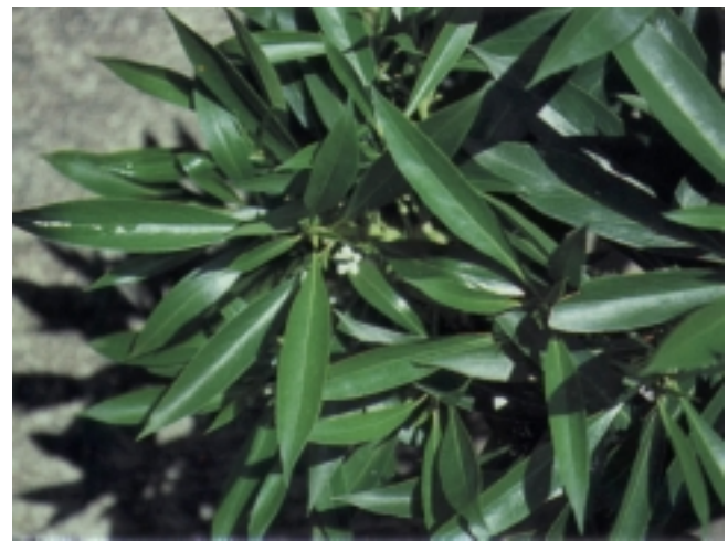
Naio ( Myoporum sandwicensis ) is a shrub or small tree, ideal in the landscape or as a potted specimen plant.

Landscape uses. Naio is naturally a shrub or, with time, a small tree. It is a good specimen or hedge plant. Its broad, natural elevational range indicates that it will do well in coastal and upland sites in Hawai'i.