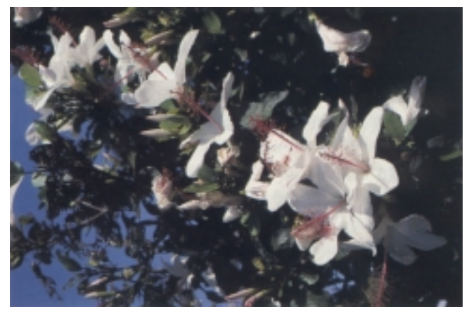
The O'ahu white hibiscus ( Hibiscus arnottianus var. punalu ensis ), seen here growing at Moanalua Gardens, has white flowers with a subtle fragrance.

Each of these Hawaiian white hibiscuses is unique and possesses a slightly different fragrance. However, their propagation and landscape uses are similar, so they