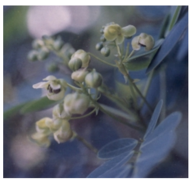
This green-flowered, native shrub, kolomona ( Senna gaudi-chaudii ), is drought tolerant and can be used as a hedge, specimen planting, or potted plant.

Landscape uses. Kolomona makes an attractive, sprawling shrub for the landscape. It is quite drought tolerant and is a good candidate for the xeriphytic garden. It can also be grown in a large pot and placed in a sunny location. Its close pan-tropical relative, Senna surratensis