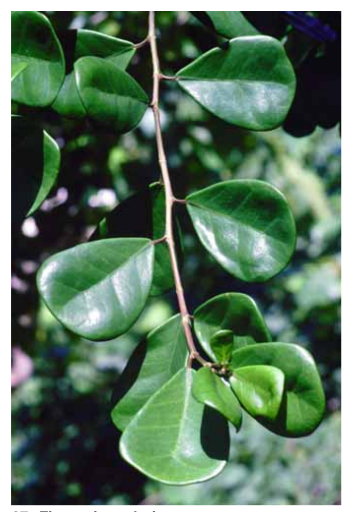
27. Ficus triangularis