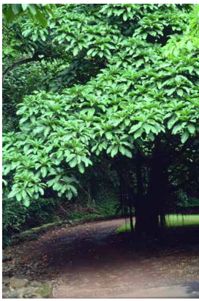
24. Ficus saussureana