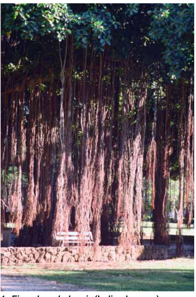
1. Ficus benghalensis (Indian banyan)