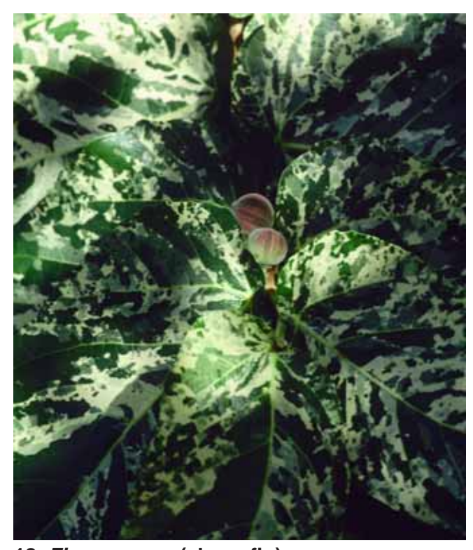
18. Ficus aspera (clown fig)