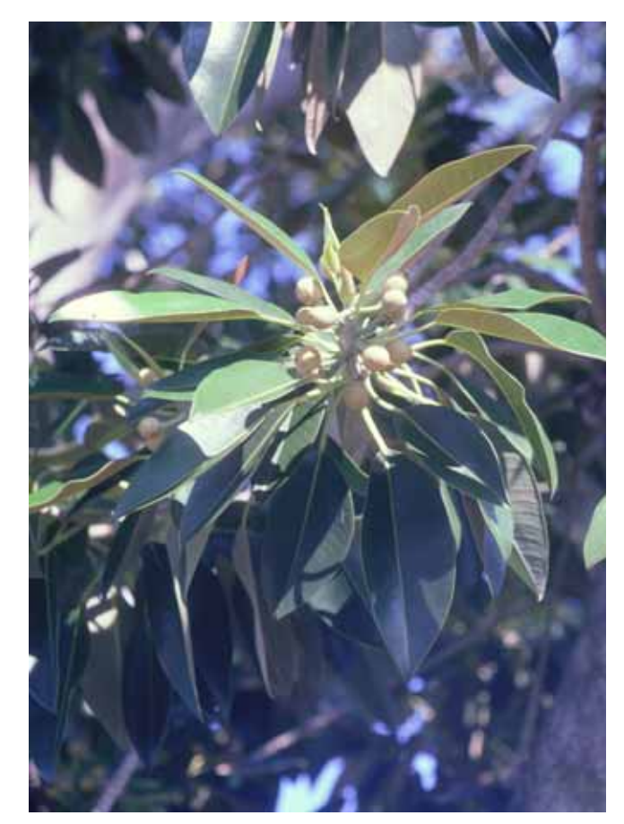
6. Ficus macrophylla