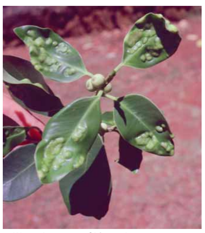
3. Wasp damage to Chinese banyan