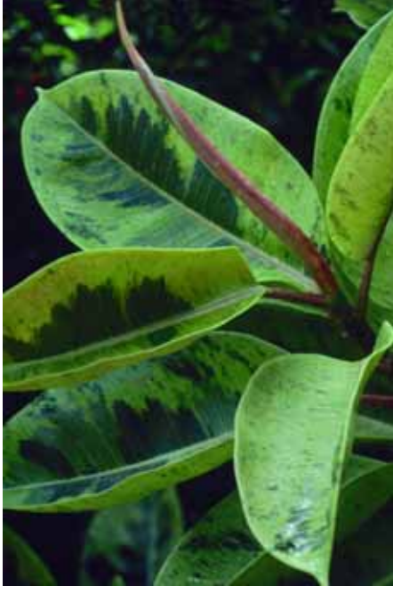
8. Ficus elastica 'Schrijveriana' 9. Ficus elastica 'Abidjan'