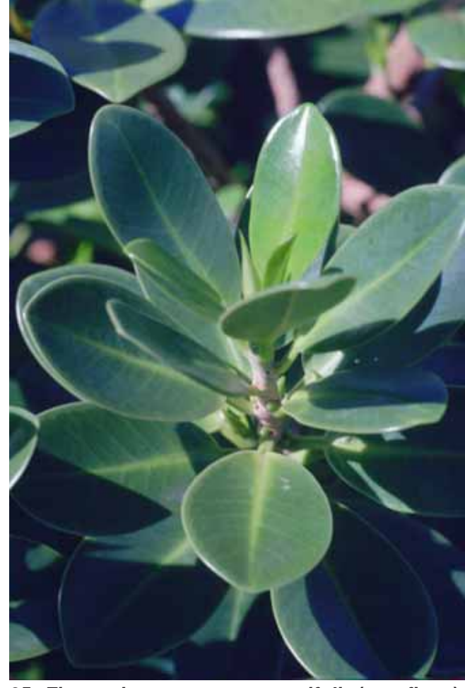
25. Ficus microcarpa var. crassifolia (wax ficus)