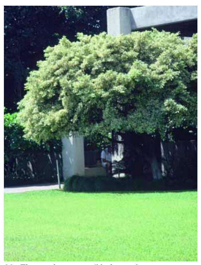
22. Ficus microcarpa 'Variegata' (variegated Chinese banyan)