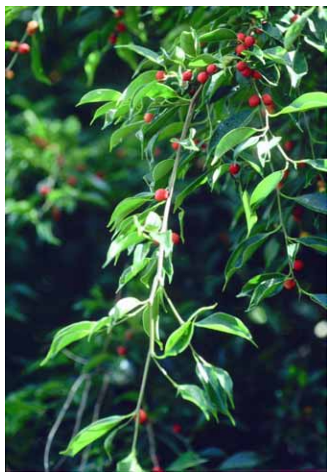
31. Ficus benjamina 'Exotica'