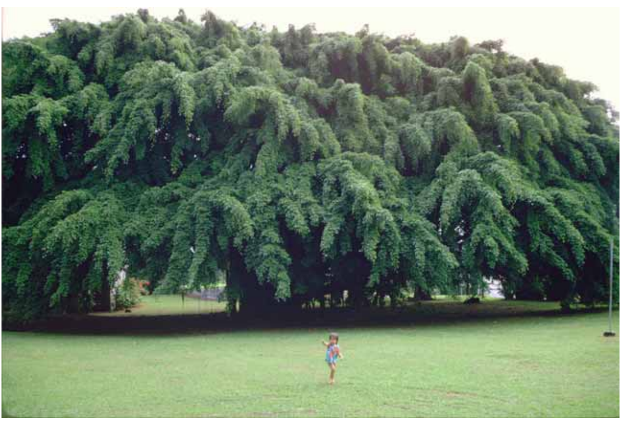
4. Ficus benjamina (weeping fig)