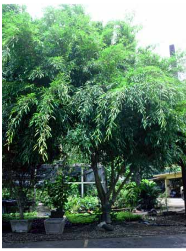
20. Ficus celebensis (willow ficus)