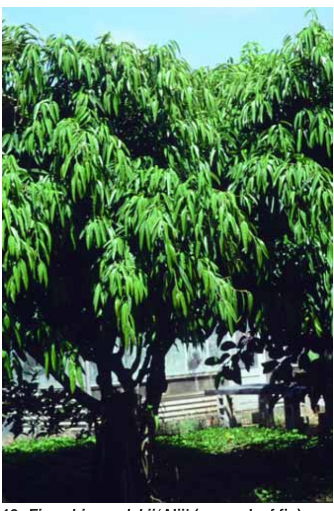
19. Ficus binnendykii 'Alii' (narrowleaf fig)