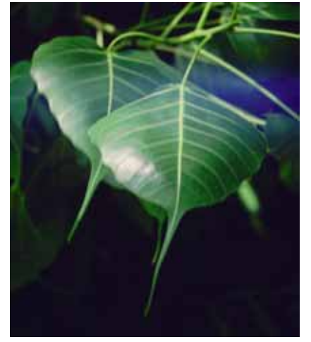
7. Ficus religiosa (bo tree)