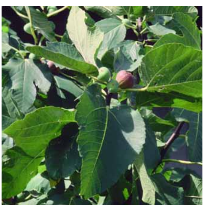
16. Ficus carica (edible fig)