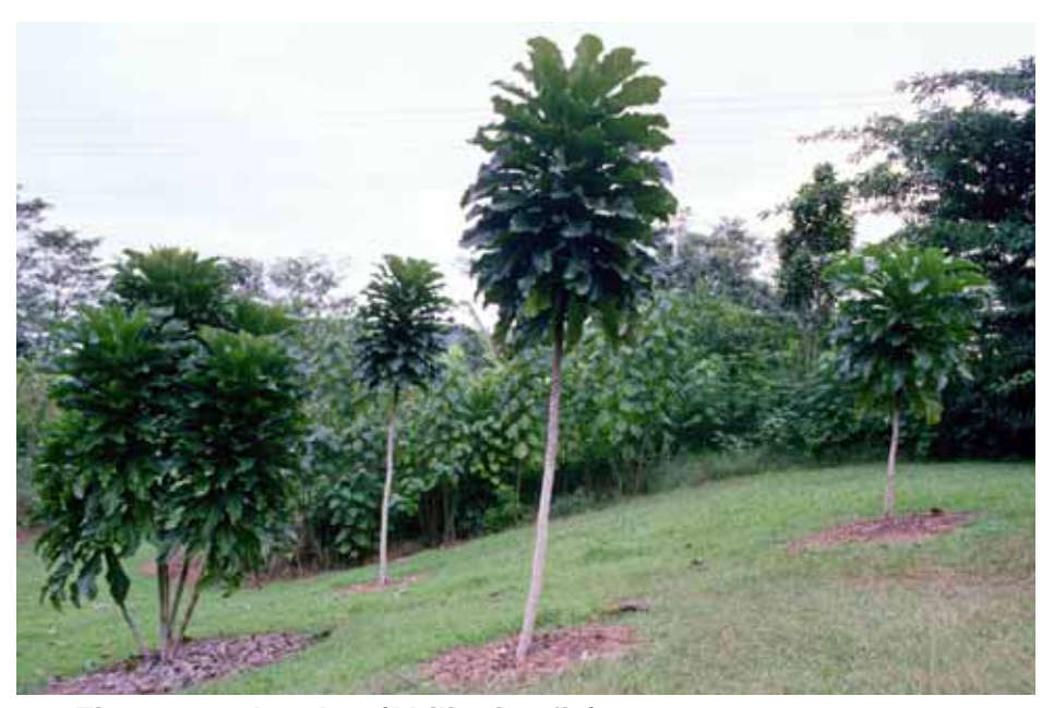
23. Ficus pseudopalma (Philippine fig)