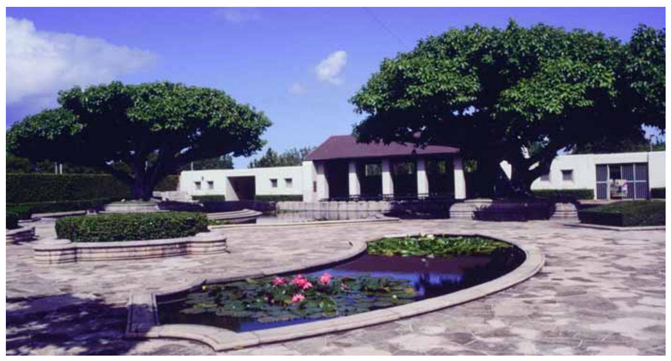
5. Ficus altissima (council tree)