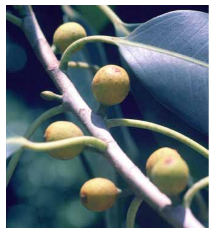
15. Ficus rubiginosa (rusty fig)