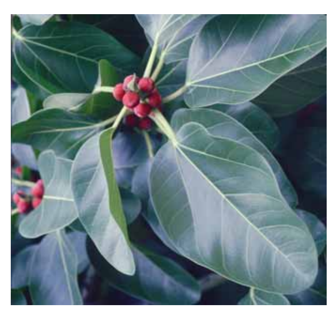
1. Ficus benghalensis