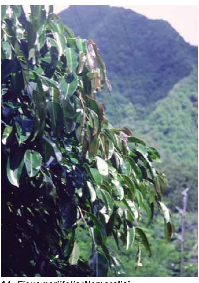
14. Ficus neriifolia 'Nemoralis'