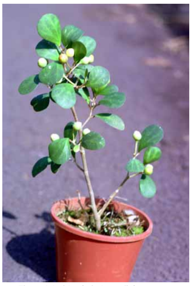
28. Ficus deltoidea (mistletoe fig)