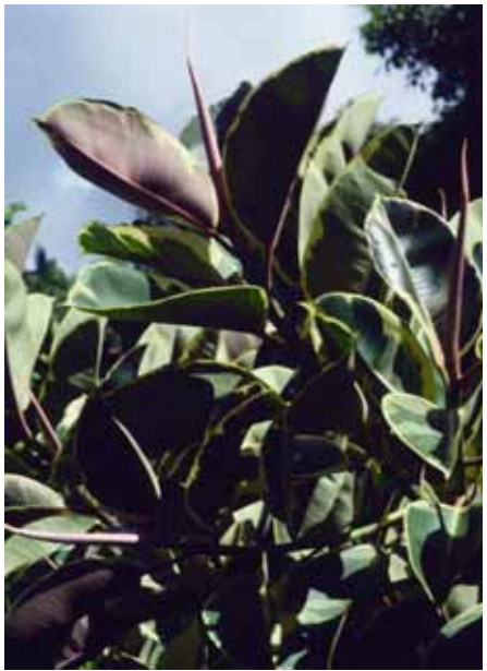
11. Ficus elastica 'Asahi'