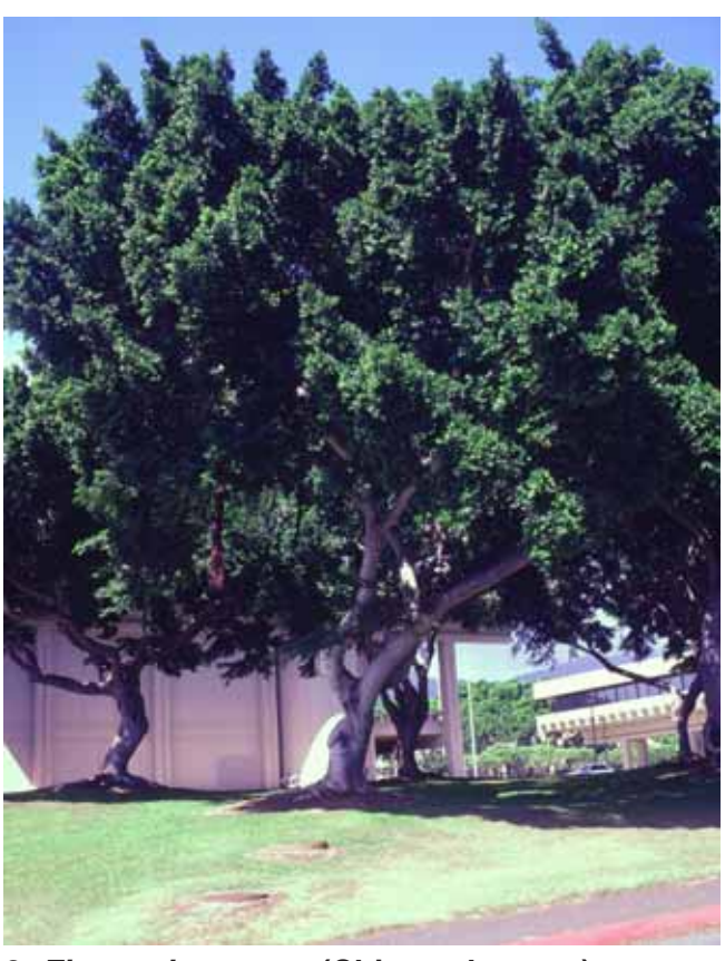
2. Ficus microcarpa (Chinese banyan)