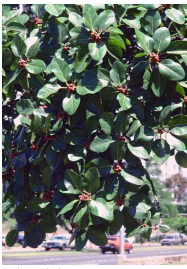
5. Ficus altissima