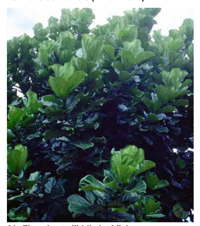
21. Ficus lyrata (fiddle-leaf fig)