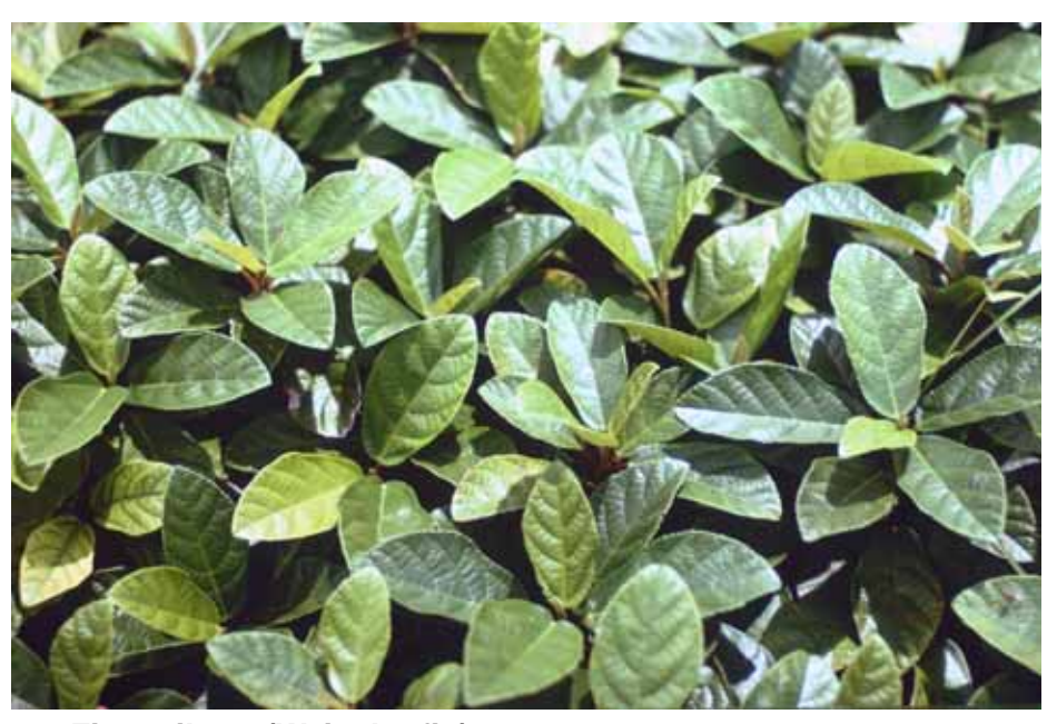
30. Ficus tikoua (Waipahu fig)