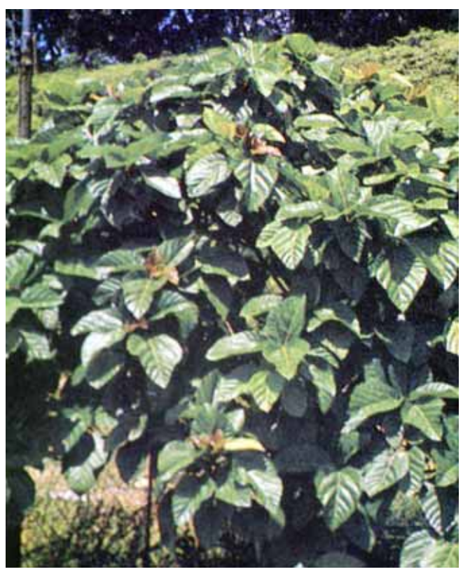
17. Ficus auriculata