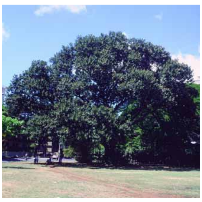
6. Ficus macrophylla (Moreton Bay fig)