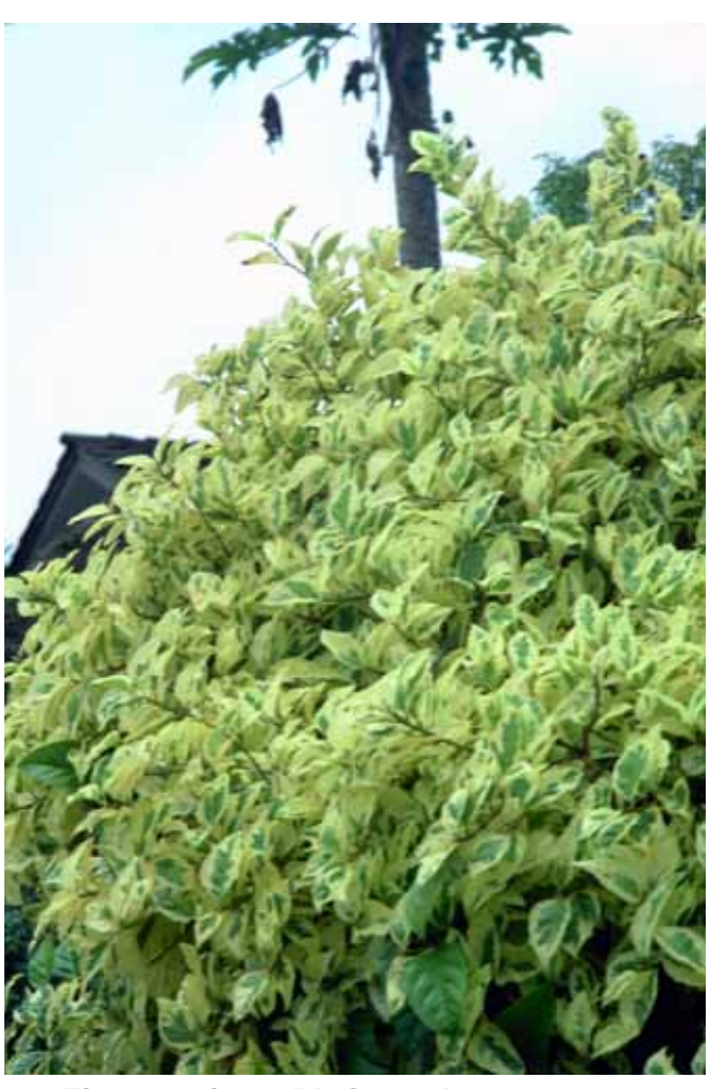
26. Ficus sagittata 'Variegata'