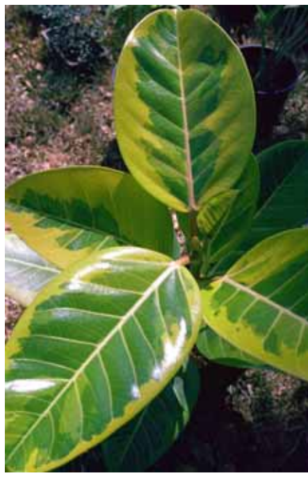
12. Ficus elastica 'Gold'