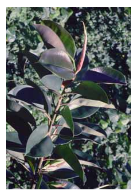
10. Ficus elastica 'Decora'