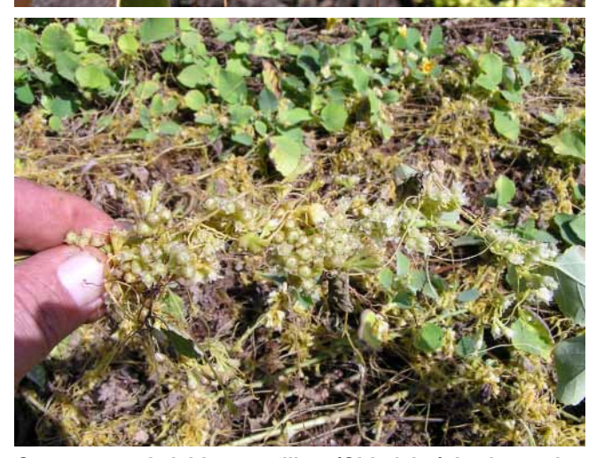
Cuscuta sandwichiana on 'ilima (Sida falax); both species are endemic to Hawai'i.