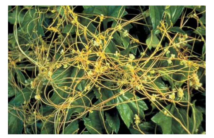
Flowers of Cuscuta species (dodders) occur in cymose to globose clusters; these plants tend to spread across and parasitize herbaceous plants at ground level.

published literature. In Hawai'i, the three similar parasitic seed plant species are C. filiformis (indigenous), Cuscuta sandwichiana (endemic), and Cuscuta campestris (introduced) (Table 1).