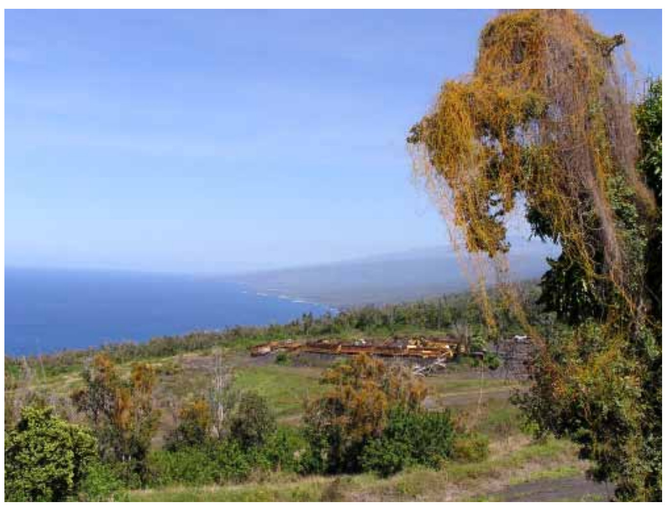
Cassytha filiformis is spreading along the roadways of the South Kona coast of the island of Hawai'i where lands have been bulldozed and developed. Here, C. filiformis is a parasite of 'ohi'a lehua ( Metrosideros polymorpha ) and other plants, creating an eyesore in landscapes.

tial human health applications. For instance, ocoteine, a compound isolated from C. filiformis , was found to be an alpha 1-adrenoceptor blocking agent in rat thoracic aorta. This type of chemistry has potential applications for inhibiting certain carcinomas such as prostate cancer. Octoeine and a number of other compounds in C. filiformis have have antiplatelet aggregation activity.