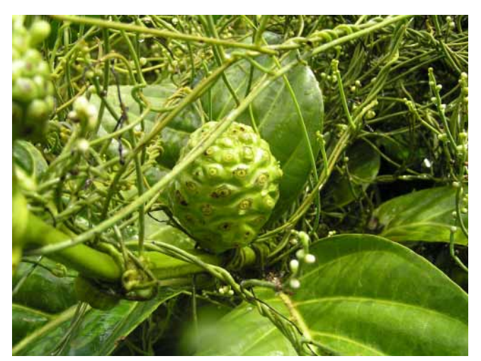
Cassytha filiformis on noni (Morinda citrifolia), in the coastal Puna district, island of Hawai'i

Photos: Unless noted otherwise, photos are by S. Nelson.