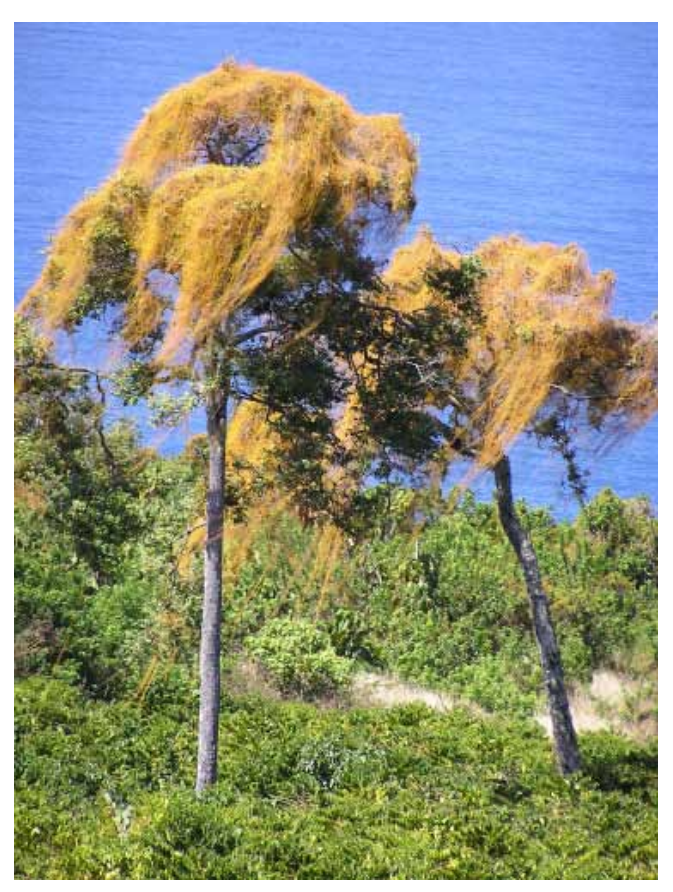
Cassytha filiformis on Metrosideros polymorpha ('ōhi'a) on the South Kona coast, island of Hawai'i

The two Cuscuta species in Hawai'i and C. filiformis are sometimes confused. In fact, they are all nowadays sometimes referred to by the same name in the Hawaiian language, kauna'oa. This fact calls into question the accuracy some of the reported host ranges found in the