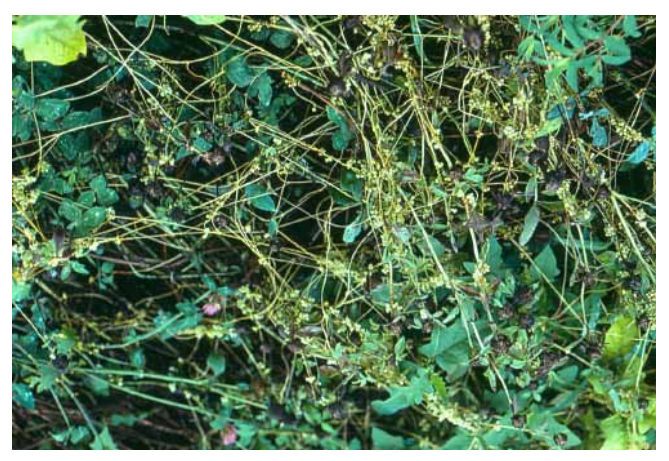
Cuscuta campestris on the legume white clover (Trifolium repens); both species are introduced to Hawai'i.