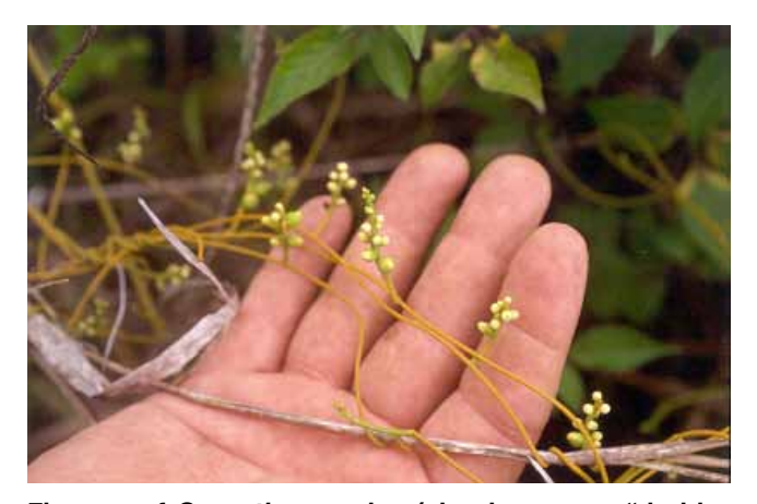
Flowers of Cassytha species (also known as "dodder laurels") occur in spicate or racemose clusters; these plants tend to climb up and parasitize larger woody plants and shrubs.