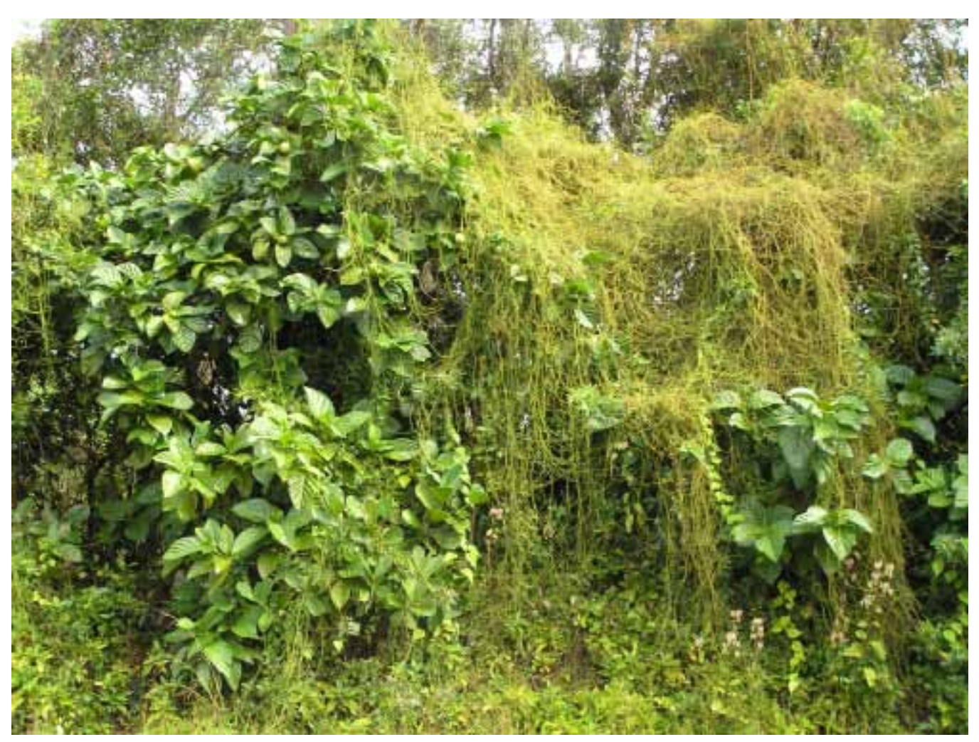
Cassytha filiformis enshrouding and bridging noni (Morinda citrifolia) plants in the coastal Puna district on the island of Hawai'i.

lular nutrients and water from plant phloem and xylem. Even though the haustorium is an intracellular structure, it is not in direct contact with the host cell cytoplasm. In the case of phloem tissues, the cells of the plant host and the pathogen are separated by their respective cell membranes. Nutrients and fluid pass through these membranes. After the haustorium directly penetrates the cell wall, the haustorium does not penetrate or break through the plasmalemma membrane, but rather invaginates it.