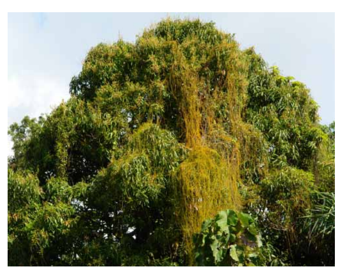
Cassytha filiformis on mango (Mangifera indica), Hilo International Airport

Human practices associated with the spread and increased severity of C. filiformis infestations include air travel ( C. filiformis is a common parasite around airports