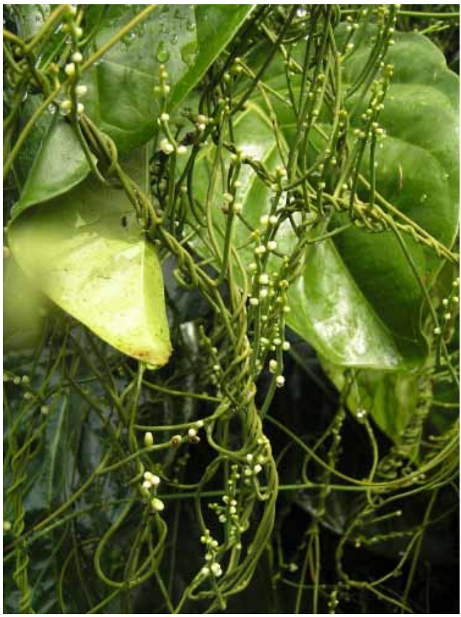
Twining habit of vine-like stems of Cassytha filiformis on noni (Morinda citrifolia); the genus name Cassytha derives from kesatha, Aramaic for "a tangled wisp of hair."