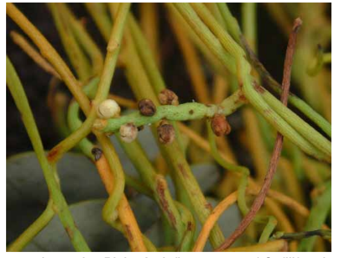
Left: Cassytha filiformis stems and haustoria on Metrosideros polymorpha. Right: An inflorescence of C. filiformis and haustorial attachments of stems of C. filiformis to other stems, demonstrating the autoparasitic nature of this plant.