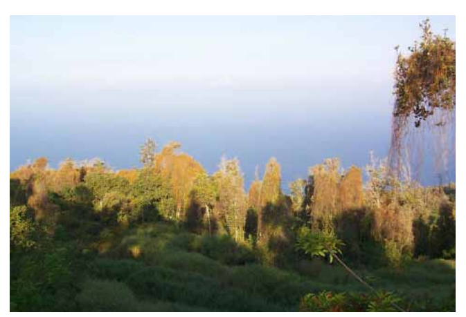
A severe infestation of Cassytha filiformis bridging several tree species, shrubs and surrounding vegetation on the South Kona coast of the island of Hawai'i

• Do not collect soil for nurseries or gardens from the vicinity of C. filiformis -infected plants.