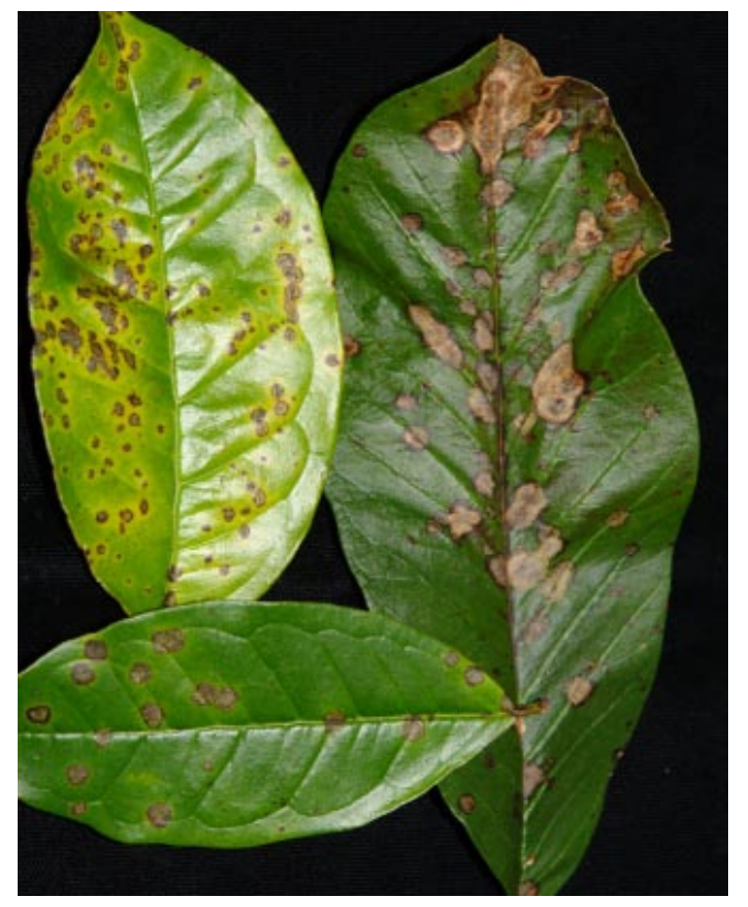
Guava cultivars may express symptoms differently. Here, leaves of three Psidium cultivars growing in a UH-CTAHR collection in the Hilo area display their unique reactions to association with Cephaleuros parasiticus .

Finding a number of different algal species on a leaf is common in shaded, moist environments. Most of the algae are not parasitic on plants. If you can easily rub off algae with your fingers, they are probably not plant parasitic.