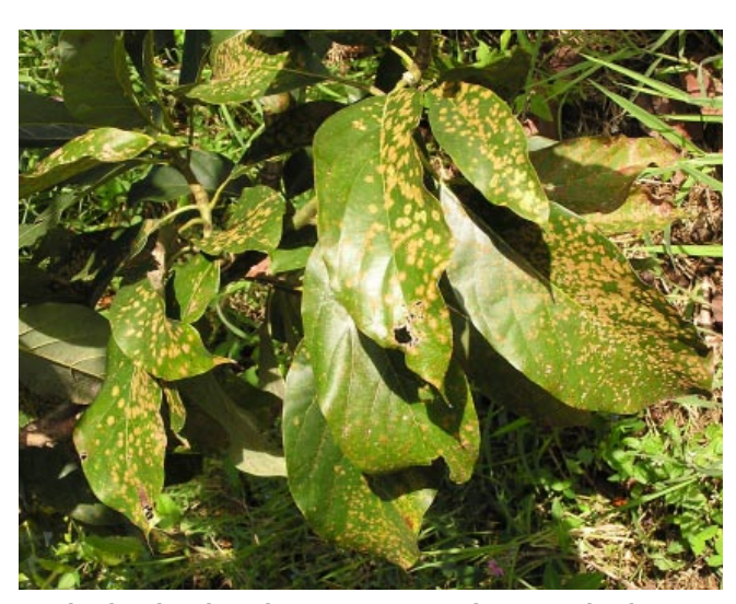
Typical raised, velvety, coppery brown algal spots on leaves of avocado ( Persea americana ) caused by Cephaleuros virescens . The spots consist of the brightly pigmented thallus of the plant parasitic algae.

Most fruit damage from Cephaleuros in Hawai'i probably occurs on guava and is associated with C. parasiticus . The damage to guava fruits is limited to the