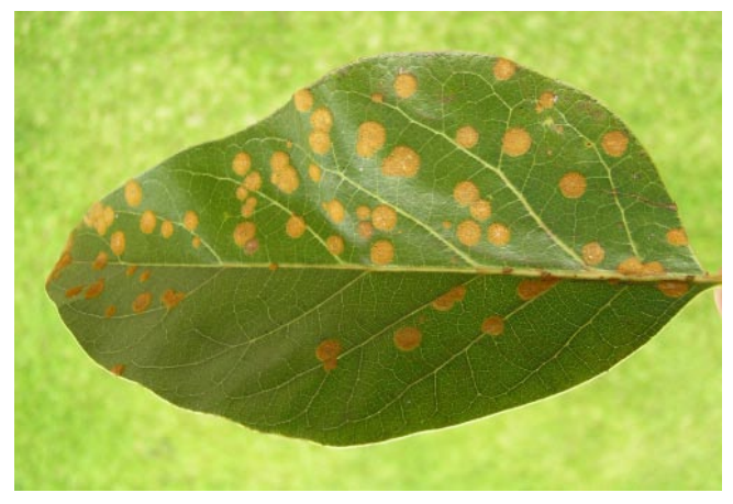
Algal leaf spot of avocado ( Persea americana ) in Hilo, Hawai'i, caused by Cephaleuros virescens

The disease is called algal leaf spot, algal fruit spot, and green scurf; Cephaleuros infections on tea and coffee plants have been called "red rust." These are aerophilic, filamentous green algae. Although aerophilic and terrestrial, they require a film of water to complete their life cycles. The genus Cephaleuros is a member of the Trentepohliales and a unique order, Chlorophyta, which contains the photosynthetic organisms known as green algae.