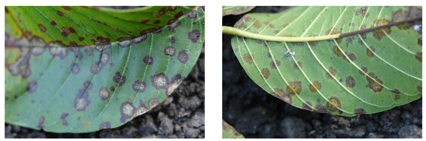
Left: Cephaleuros parasiticus spots on guava leaves appear initially as tiny, dark brown specks that enlarge into roughly circular lesions with ash-colored centers and dark brown to blackened margins (Hakalau, Hawai'i). Right: On the underside of the same leaf, spots appear as dark gray, circular and watersoaked. The brightly pigmented algal thallus and sporagiophores emerge in yellowish-orange clusters within rings in the dark, watersoaked lesions. Lesions tend to form along the leaf midrib and as damage progresses the vein can collapse and die (Hakalau, Hawai'i).