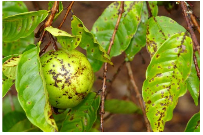
Cephaleuros parasiticus leaf spots on some guava cultivars are surrounded by yellow halos, and the associated fruit damage can be significant (near Hilo, Hawai'i).

C. virescens leaf spots on guava consist of velvety patches of algal bloom on the upper leaf surface. Fruits can be severely spotted. C. parasiticus causes a non-velvety spot type that mimics a rust disease.