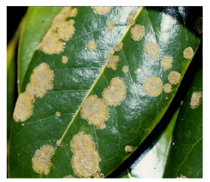
Algal leaf spot of magnolia (Magnolia grandiflora) in Kurtistown, Hawai'i caused by Cephaleuros virescens

as well some citrus ( Citrus spp.) cultivars. Cephaleuros species do not affect certain key subsistence crops in the Pacific, such as banana ( Musa spp.) and taro ( Colocasia esculenta ), although coconut and breadfruit are hosts for leaf spots.