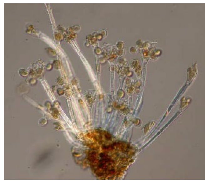
Cephaleuros parasiticus thallus and sporangiophores. Upon making a slide mount in a drop of water, zoospores may be relseased immediately (from material collected in American Samoa.)