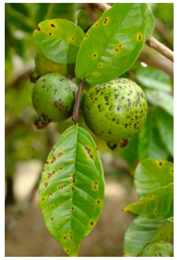
Algal leaf and fruit spot of guava caused by Cephaleuros parasiticus

Hosts are inoculated when sporangia or thallus fragments with sporangia are deposited on susceptible host tissues. Infection occurs and symptoms develop under moist conditions when motile zoospoores are released from