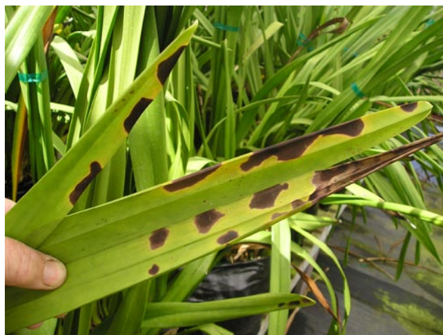
Cymbidium orchid