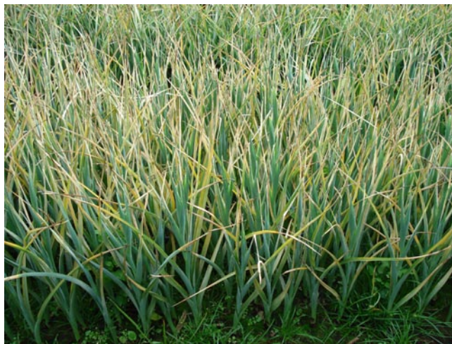
Dutch iris