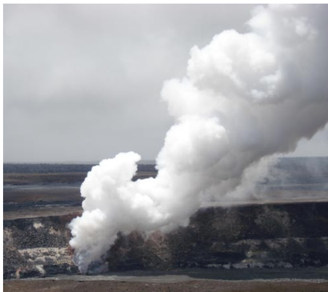
At Halema'uma'u in Hawai'i Volcanoes National Park, beginning on March 12, 2008, volcanic emissions emerged from a new vent and contained high concentrations of sulfur dioxide, some other gases, and volcanic ash.

Agricultural crops and other plants are subject to injury by exposure to the pollutants that emerge from Kīlauea, especially when they are present in high concentrations. Farmers and gardeners in the path of the pollutants (SO 2 and acid rain) have reported significant damage to plants caused by the northeasterly and southeasterly winds bringing SO 2 fumes from Pu'u 'Ō'ō and Halema'uma'u to downwind areas, such as those immediately surrounding Kīlauea, Pāhala, and Hawaiian Ocean View Estates.