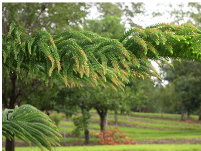
Norfolk Island pine

glycine ( Neonotonia wightii ) honohono grass ( Commelina diffusa ) a rush (unidentified)