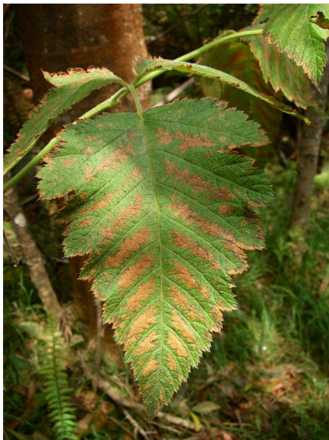
'Ākala Photos, p. 6–7 (unless noted otherwise): P. Scowcroft