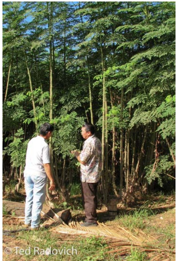
Left: Very young pods contain little fiber and can be cooked like string beans. Right: Commercial production of moringa leaf in Kuniā, O'āhu, primarily for export to the U.S. mainland (West Coast) and Canada.