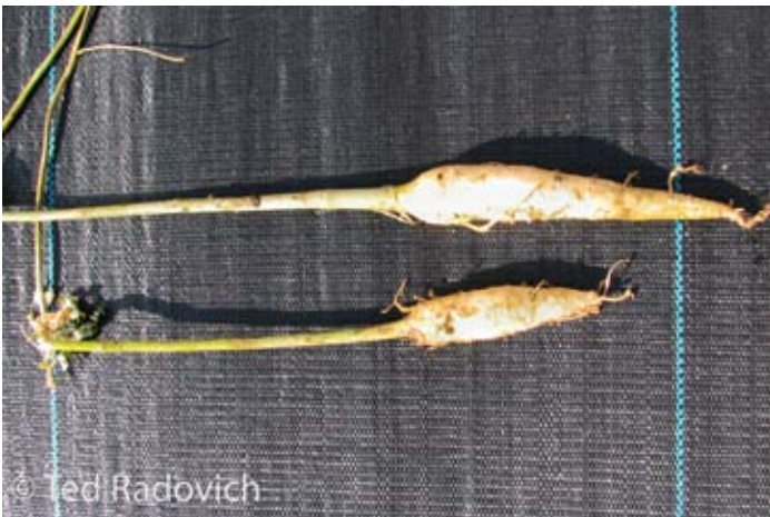
Top: Moringa trees growing as living fence posts with barbed wire strung between them. Bottom: Large taproot of moringa seedlings (approx. 3 months old).

If direct seeding is not used, 1–2 month old seedlings (about 30 cm [12 in] tall, 0.75 cm [0.3 in] in diameter) or well-rooted cuttings are transplanted into well-cultivated soil. The size of transplants generated by cuttings is not important, but the root system should be well developed. If grown in heavy soils, raised beds may be used to improve drainage.