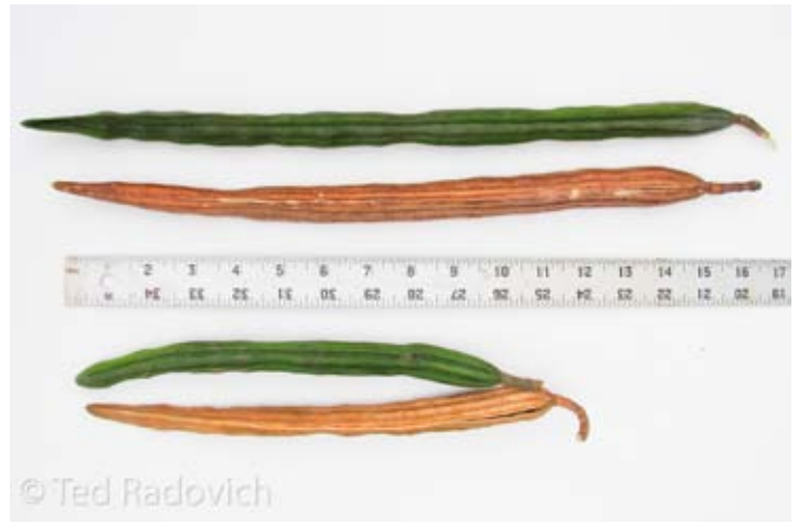
Left: Moringa variety trials, Poamoho, O'ahu. Right: Mature green and dry pods from short- and long-fruited varieties of moringa.

mize vegetative growth. Subsequent fertilizer applications after coppicing are also recommended.