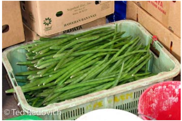
Immature pods harvested for market.

Low-tech oil expellers have been successfully used for extracting moringa oil. One such press (the "Komet press") is reported to produce 6.5 liters (7.2 qt) in 8 hours, with a 12% yield of oil. The same report said that 10 kg (22 lb) of seed yielded 1.2 kg (2.64 lb), or 1.3L (1.4 qt) of oil. Ram and screw presses have also been used for moringa oil extraction, with yields of 5–6%. Dehulling can improve oil yield, but the increase is small and may not justify the extra effort (Mbeza et al., 2002). Yields using a screw press can be improved to 20% if the seed is first crushed, 10% by volume of water is added, followed by gentle heating over low heat for 10–15 minutes, taking care not to burn the seed (Folkard and Sutherland, 2005).