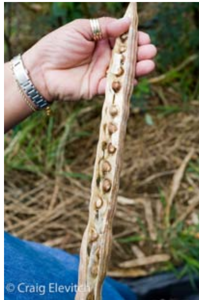
Left: Moringa flowers. Right: dried, mature pod broken open to expose seeds.

drought and poor soils, and responds well to irrigation and fertilization.