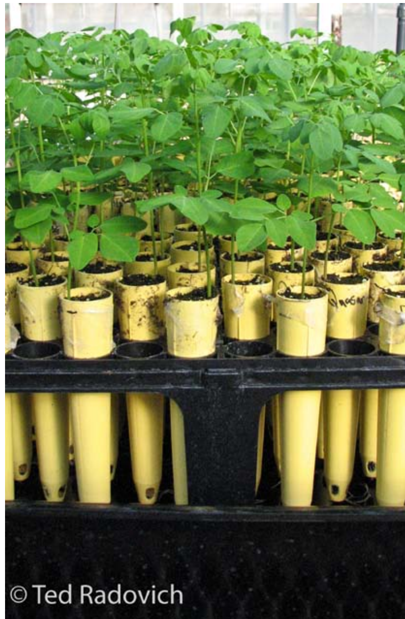
Nursery grown moringa seedlings.

Spacing for leaf production is 0.75 m (30 in) within rows and 1 m (3.3 ft) between rows. For pod production, recommended spacing is 2.5 m × 2.5 m (8.2 ft × 8.2 ft). Fertilizer and irrigation are recommended for maximum productivity. Addition of 300 g (10.5 oz) of complete fertilizer or 0.5–2 kg (1.1–4.4 lb) of manure per tree is recommended at planting. Positive yield response has been reported at N fertilization rates as high as 350 kg N per ha (312 lb N/ac). Trees have been reported to benefit from integrated (organic + synthetic) fertilization. Seedlings should be pinched at 1 m (3.3 ft) tall or 2 months after planting to stimulate side branching. Irrigation should be supplied during dry periods to maxi-