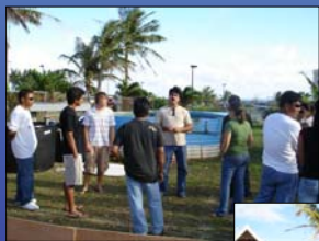
Prospective farmers and students observe and learn about the system design and operation.