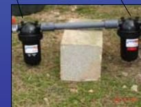
In-line disk filters (130 micron and 100 micron)