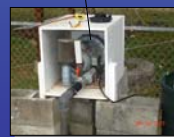
Rotary Air Blower - 1 hp