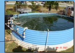
Standard aquaculture tank - 15' diameter w/ biomass of 700 pounds (tilapia fish)