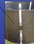
Pressure regulator @ 20 p.s.i.