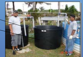
Plastic tank (400 gallon) and 2" siphon tubes