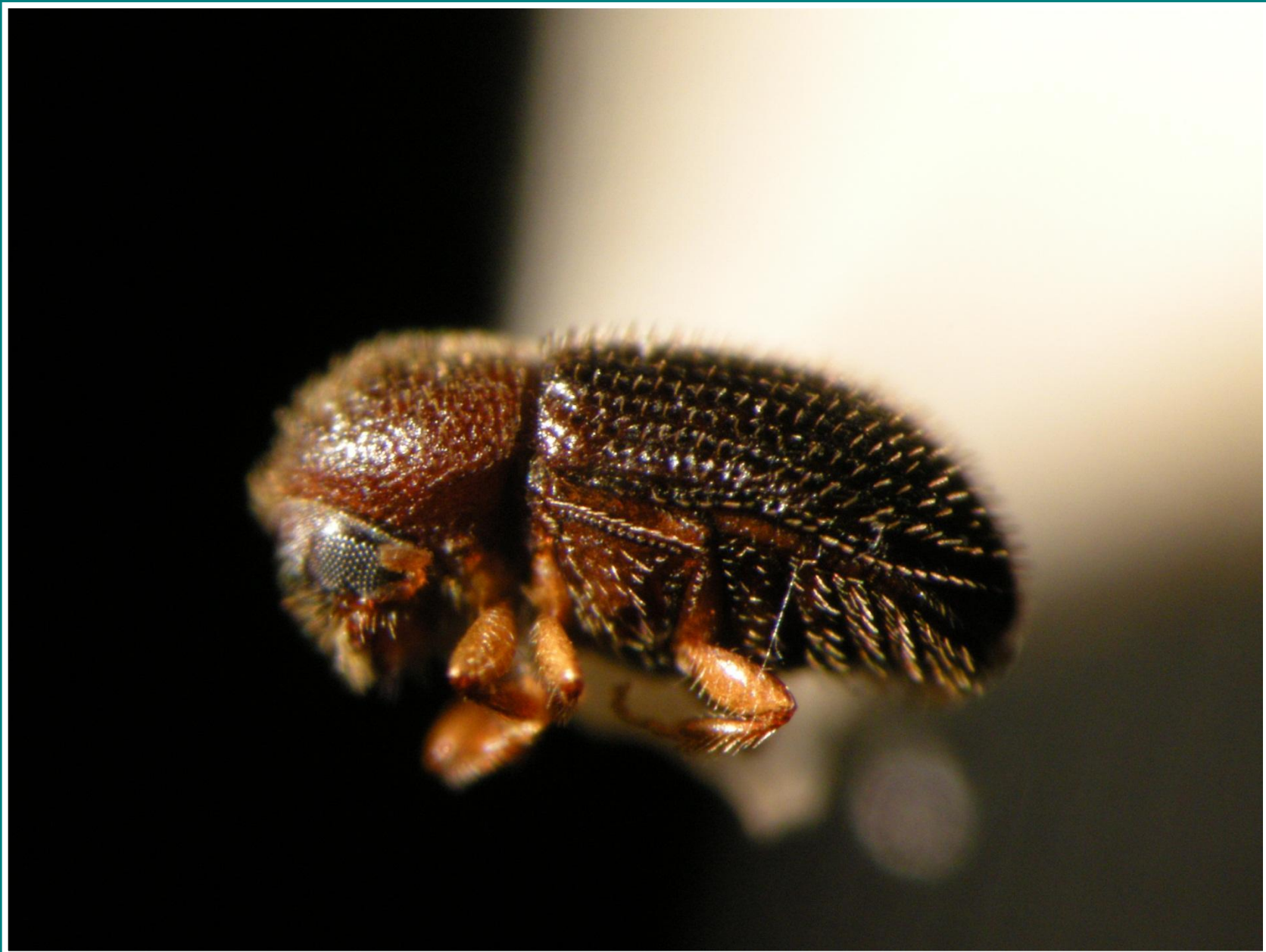
Hypothenemus hampei adult female.