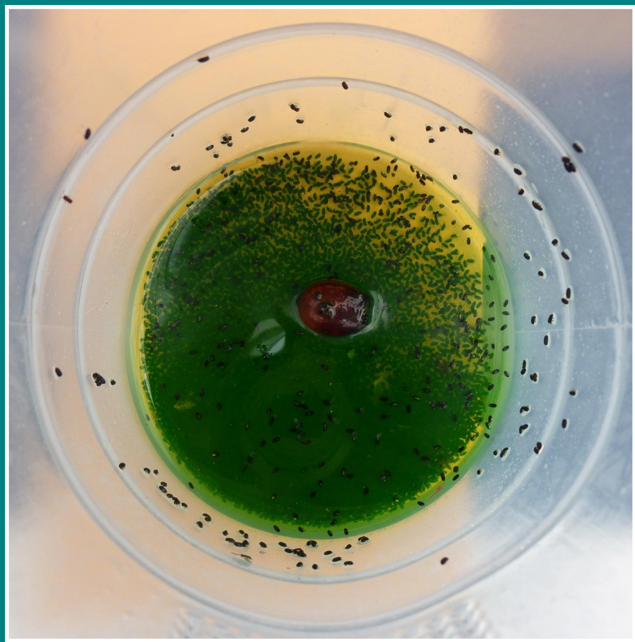
Thousands of CBB adults collected in trap at Honaunau.