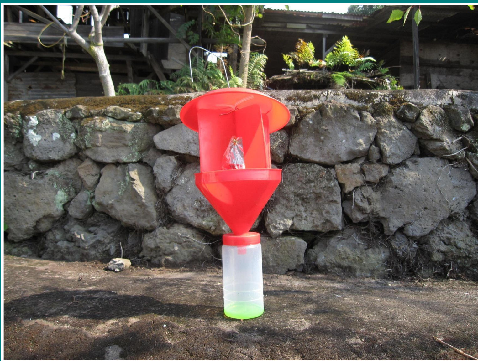
CBB trap.

The first course of action taken by HDOA was to determine the extent of the infestation along the Kona Coast of the island of Hawaii (Big Island), where the first specimens were found. The HDOA Plant Pest Control Branch (PPC) staff collected coffee berries from many coffee farms and dissected them to inspect for the presence of CBB. Suspected CBB specimens were confirmed by Kumashiro and Samuelson. It was determined that the infestations extended from Kaloko (east of the Kona International Airport) at the north end, down south to Waiohinu, near the South Point of the Big Island (See map). Through a joint survey by HDOA and USDA-APHIS-PPQ, coffee berries were also collected from coffee farms on other areas of the state and inspected for CBB. No other areas were found to be infested. An interim quarantine rule was instituted by HDOA on December 2, 2010 for the Big Island to contain CBB and establish criteria for movement of coffee plants, plant parts, unroasted beans, and used bags out of the area.