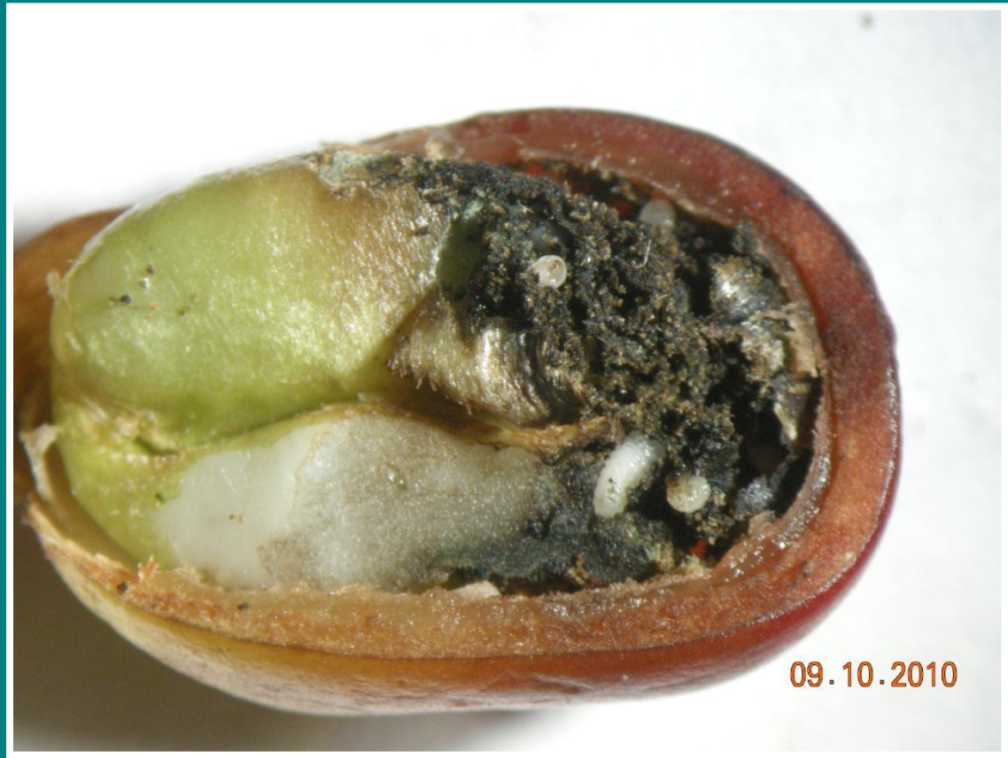
CBB larvae devouring coffee bean.