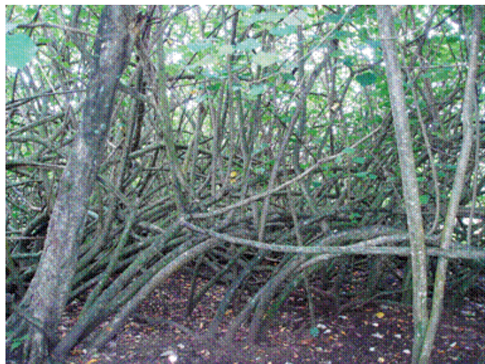
. . . not necessarily.