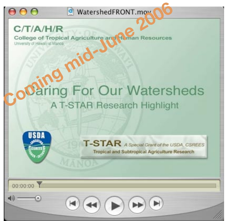
Our watershed video will be available soon!

These field research activities are complemented with a strong numerical modeling component across a wide range of temporal and spatial scales. This modeling effort is supported by different projects, among them a project funded by National Oceanic Atmospheric Administration (NOAA) that aims to evaluate the performance of N-SPECT. N-SPECT is a watershed model developed by NOAA as a management tool. Using field measured data, it evaluates the effect of land use changes on pollutant movement through coastal watersheds. This project builds and expands on the watershed modeling work that I am conducting